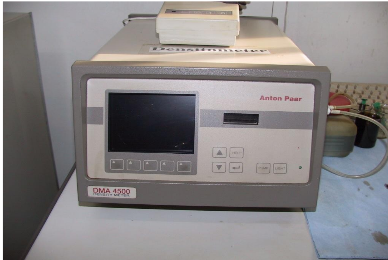
Densimeter for Measuring API and Relative Density