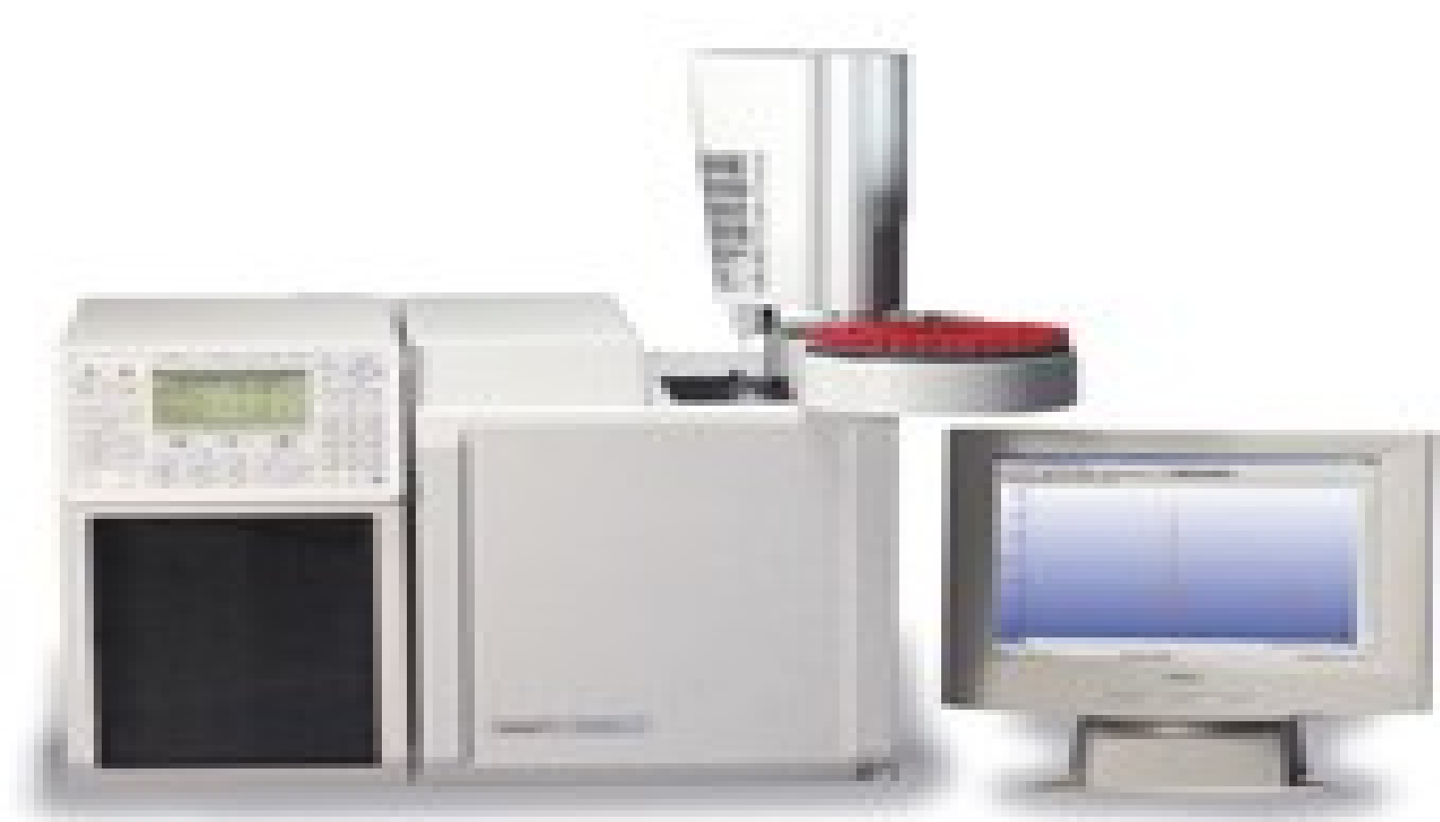
GS – 3800 Varian