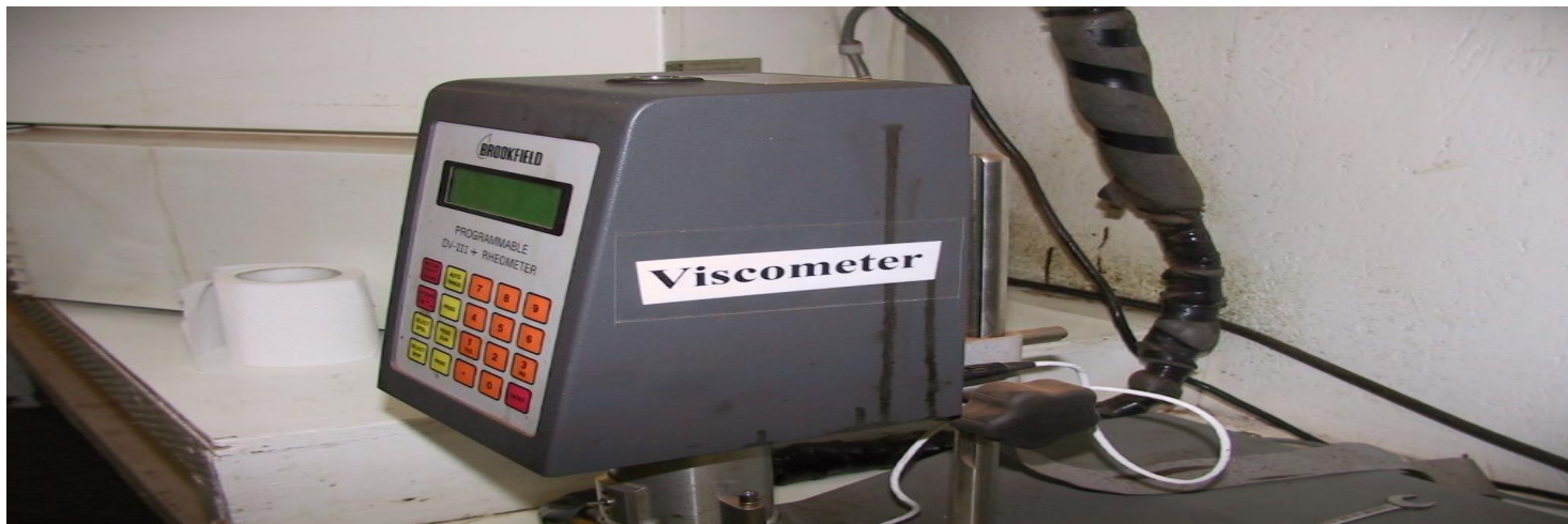
.Viscometer and connected water bath