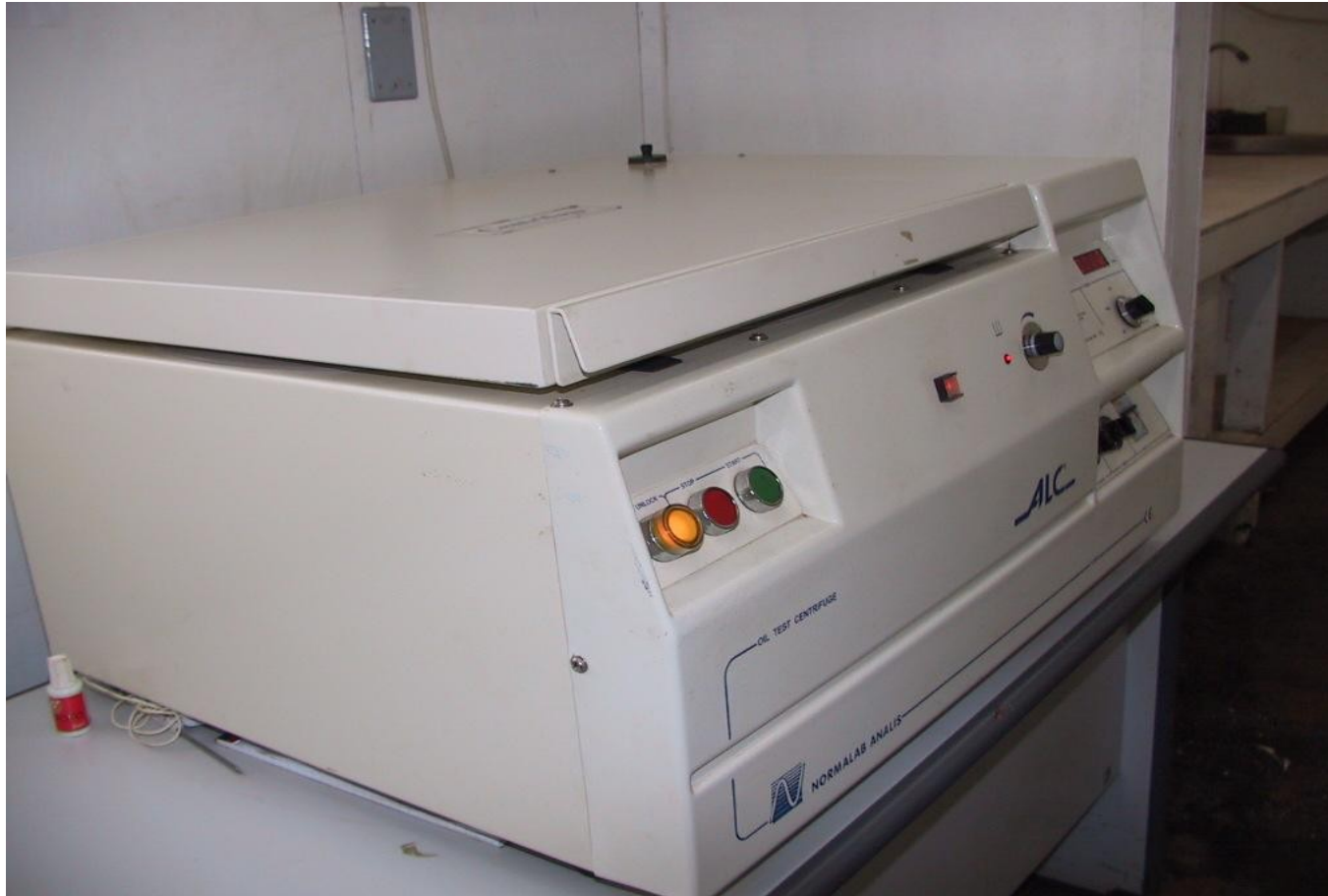
Centrifuge for Measuring Water Cut and Bottom Sediments