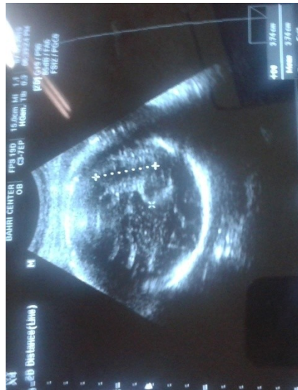
Ultrasound image of fetus in 20weak of gestation, cerebellar diameter 2,0