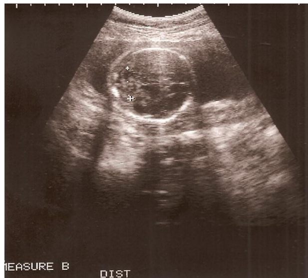
Sonogram of the posterior fossa demonstrating the measurement of the cerebellar diameter

A single CD measurement was used for each fetus studied. The measurement of CD was obtained by placing electronic calipers at the outer margins of the cerebellum. The landmarks of the thalami, cavum, septum pellucidum and third ventricle were identified thereby slightly rotating the transducer below the thalamic plane. The posterior fossa is revealed with the characteristic butterfly like appearance of cerebellum. In all cases cerebellum was seen as two lobules on either side of the midline in the posterior cranial fossa. CD measurement was taken in the coronal plane.