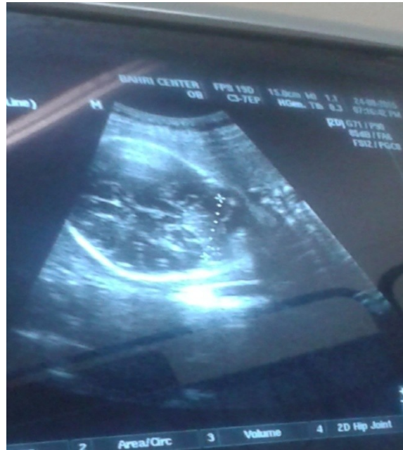
Ultrasound image of fetus in 31week and 6 days of gestation, cerebellar diameter 3,75