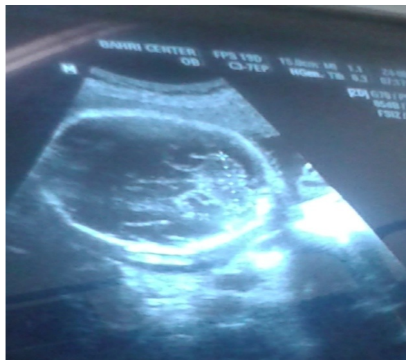
Ultrasound image of fetus in 26week and 5days of gestation, cerebellar diameter 3,54