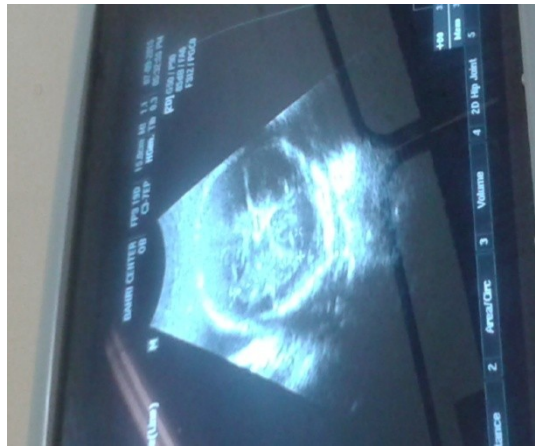
Ultrasound image of fetus in 25Week and 3Days of gestation, cerebellar diameter 3,2