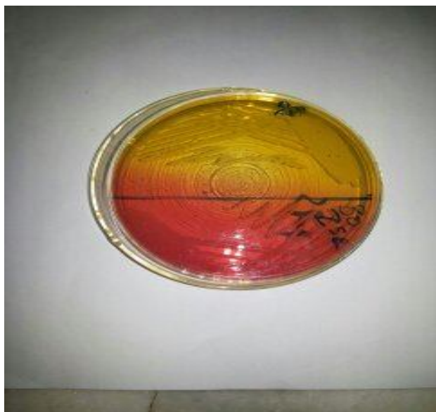
Yellow Mannitol fermenting colonies of Staphylococcus aureus strain.