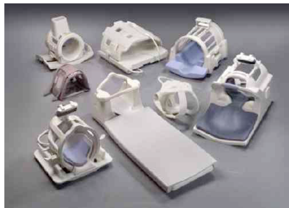
Figure (2-2) radiofrequency coils (MRI in practice).

Radio-Frequency Coils: In MRI scanners, radio-frequency (RF) transmit coils are used to transmit electromagnetic waves into a sample, creating the B1 magnetic field needed to excite the nuclear spins.