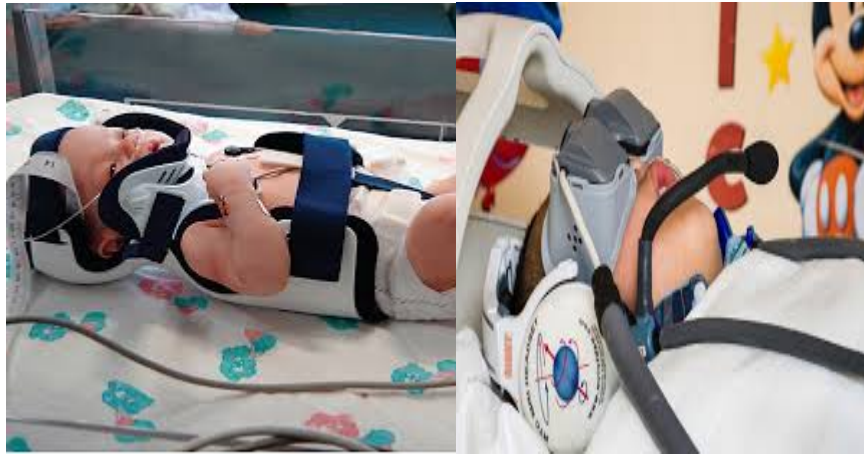
Figure (2-7): using of immobilizations device

2.4-3-6 Immobilization device: To avoid pediatric movement during procedure and avoid the use of anesthesia.