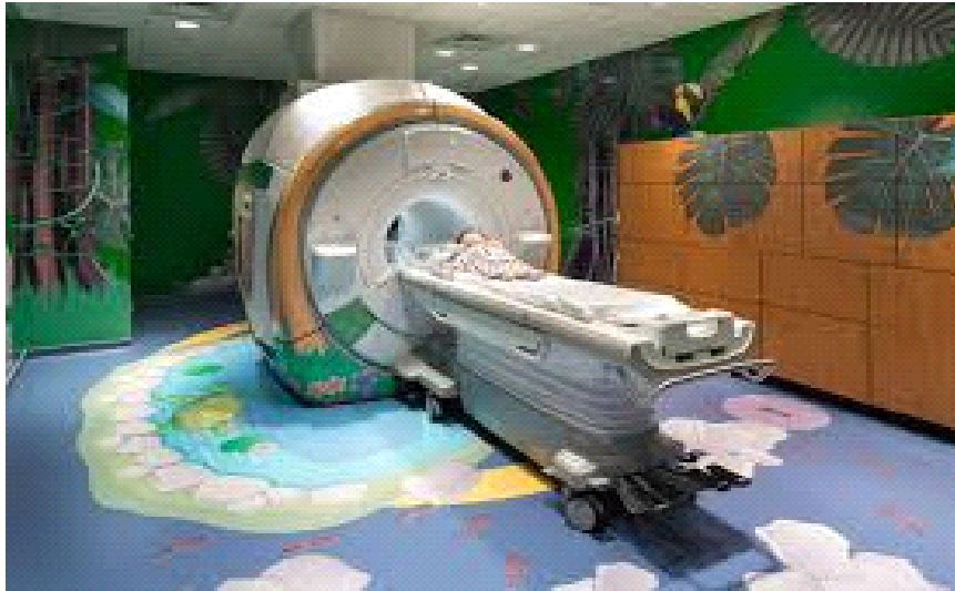
Figure (5-2) ideal MRI pediatric machine

9-Design of MRI pediatric machine should be color to avoid movement during the scan.