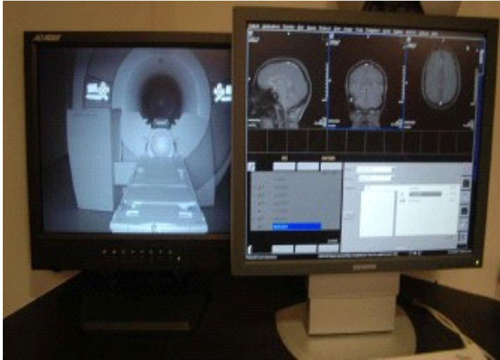
Figure (2-4) monitoring device(DICOM).