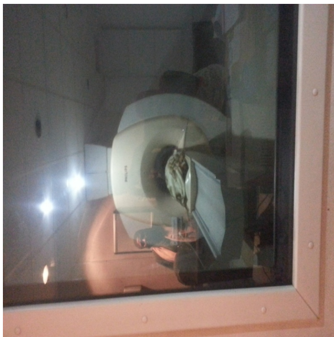
Figure (3-1): MRI machine

8-materials need for sedation: sedation agent (sybenton, ketamine, medazolam), cannula, oxygen tube.