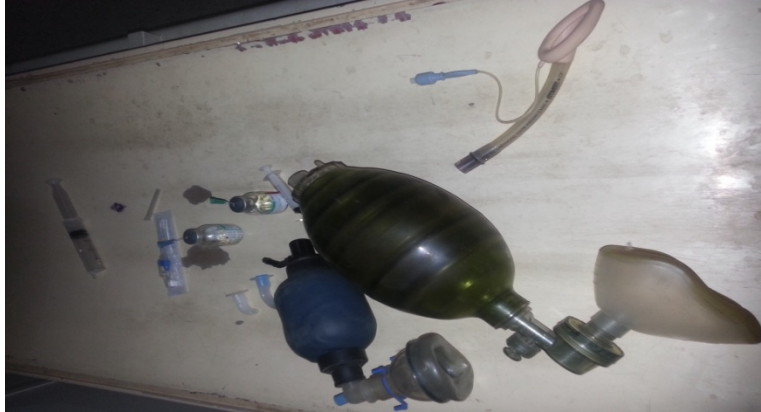
Figure (3-4) materials need for sedation