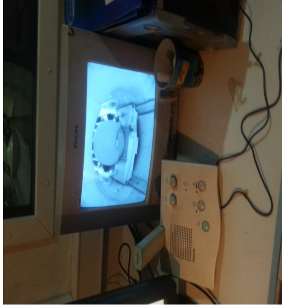
Figure (3-3) television camera