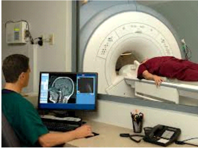
Figure (2-3) MRI console (DICOM).