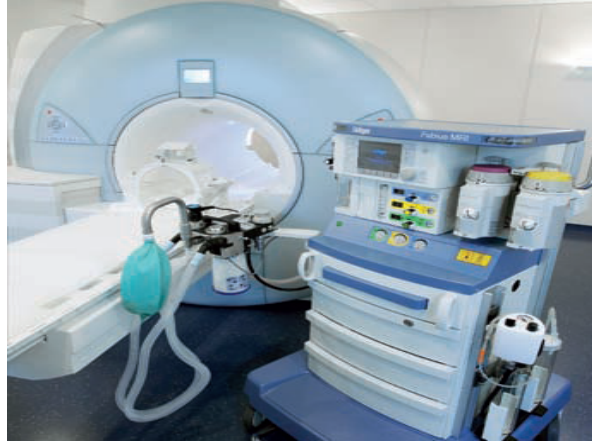
Figure (2-6) monitoring equipment (DICOM).

2.4-3-1-1 Electrocardiogram and heart rate: Monitoring the patient's electrocardiogram (ECG) in the MRI environment is particularly challenging because of the inherent distortion of the ECG waveform that occurs using MR systems operating at high field strengths. This effect is observed as blood, a conductive fluid and flows through the large vascular structures in the presence of the static magnetic field of the MR system. Electrocardiogram and Heart Rate. ( Buckwalter, 2003)