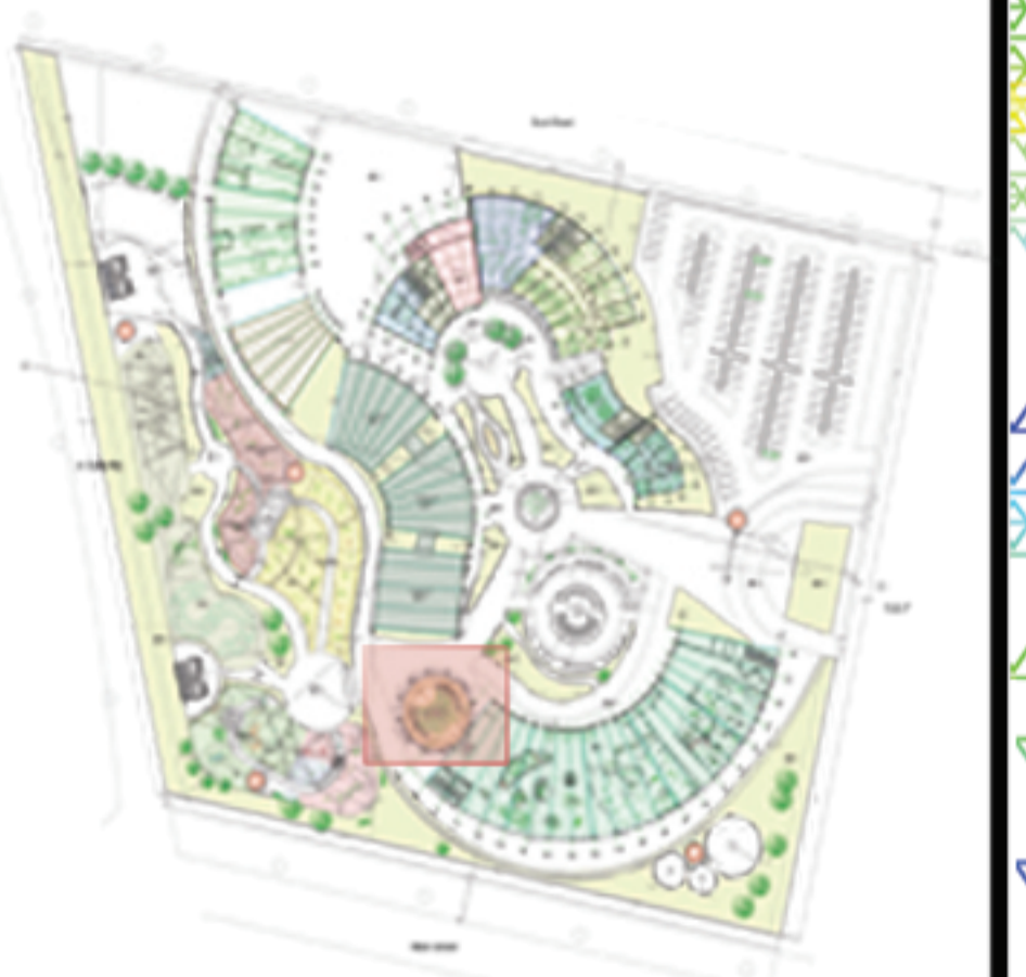
part plan(planetary) scale 1:50