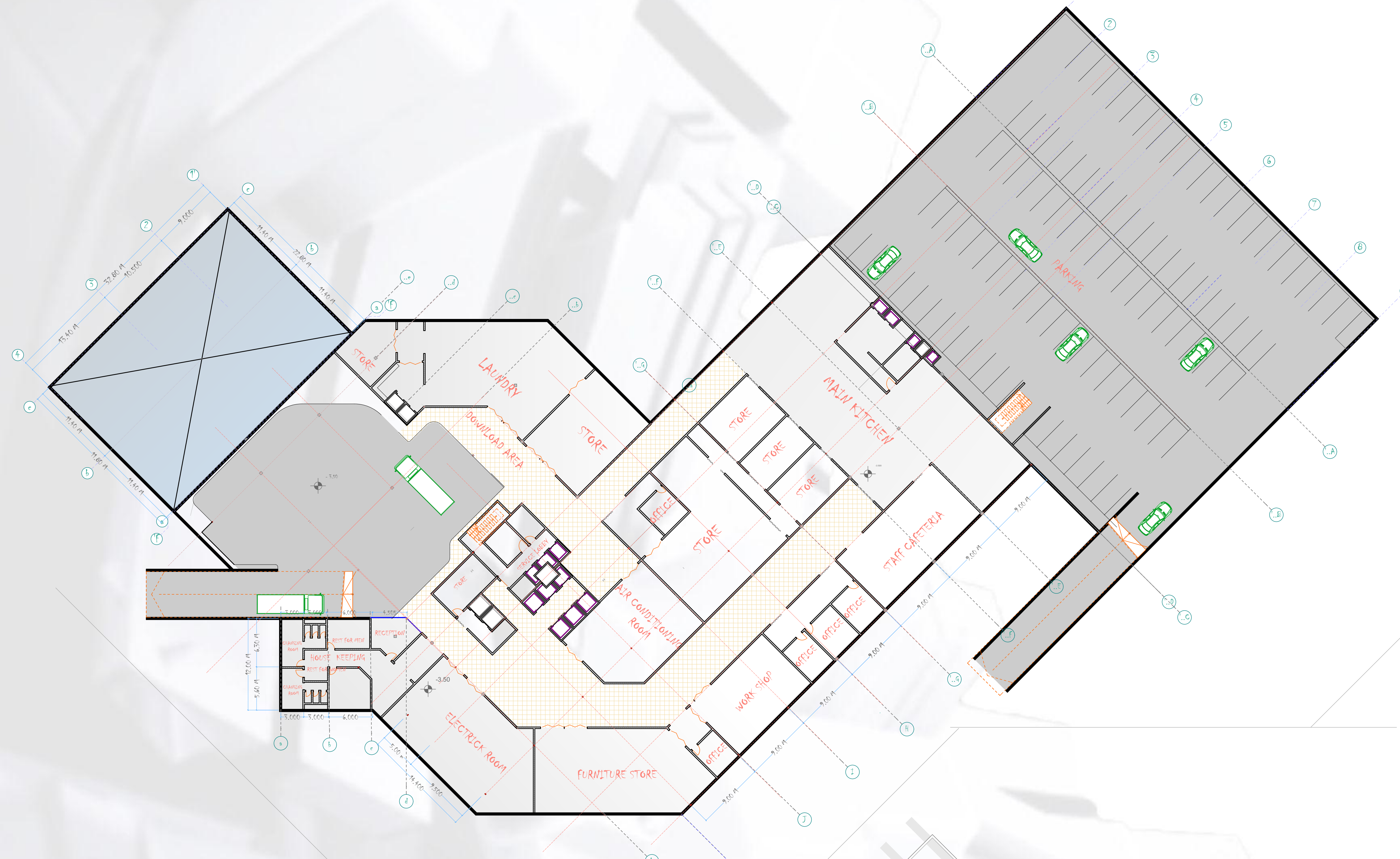
BASEMENT SCALE: 1:300

SUDAN UNIVERSITY OF SCIENCE AND TECHNOLOGY FACULTY OF ARCHITECTURE AND PLANNING DEPARTMENT OF DESIGN FIFTH YEAR FIVE STARS HOTEL