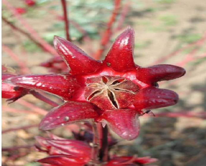
Fig. 2.1. Photo of Hibiscus Sabdariffa calyx