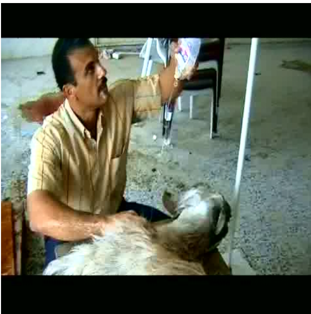
Fig(13) treatment of pregnancy toxemic goat with 25% glucose by I.V set