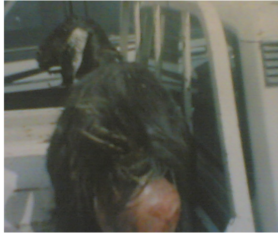
Fig(6):-Vaginal prolapse of goat in last stage of pregnancy predispose to pregnancy toxemia.