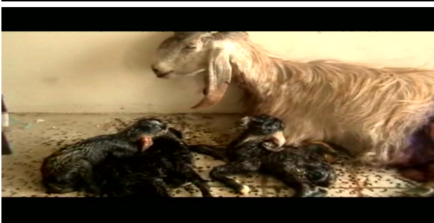
Fig(17):- skin closer of the same goat above. mother