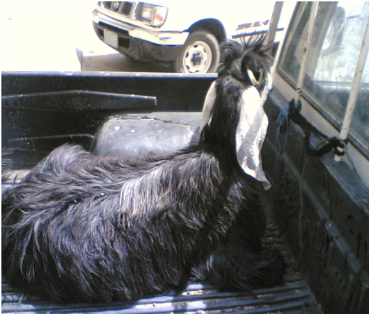
Fig(7) Extended abdomen and star grazing goat with mild stage of Pregnancy toxemia