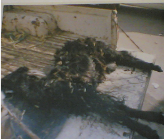
Fig(5):- Goat with pregnancy toxemia and tetanic convolution.