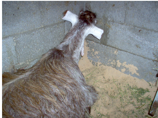
figure(2)- shamia goat with pregnancy toxemia show head against wall (Hypoglycemic)