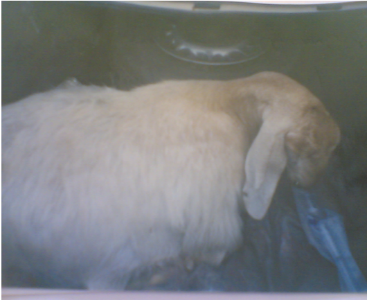
Figure(1) mild case of pregnancy toxemic goat with recumbency, twisted head and neck . encephalopathy)