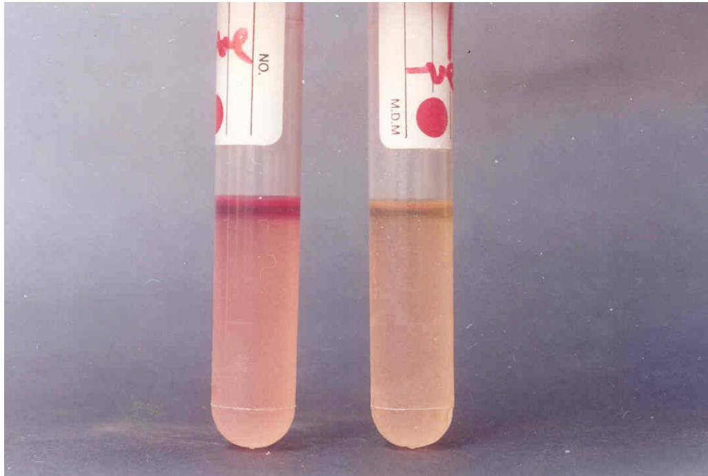
Plate (9) showing indole test