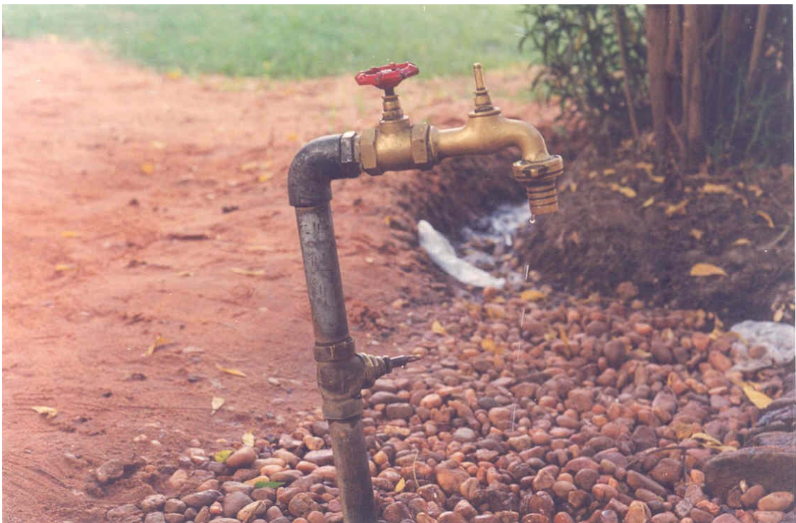
Plate (4) a tap from which samples were collected