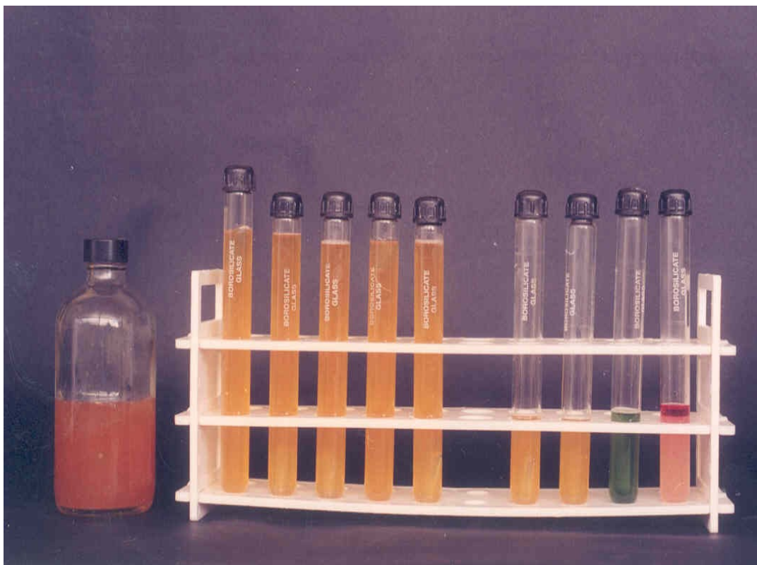
Plate (8) showing both Presumptive and confirmed test Confirmed test showed turbidity in Brilliant green bile salt and positive indole Test) In Elrayad Hara 8 (MPN = 50)