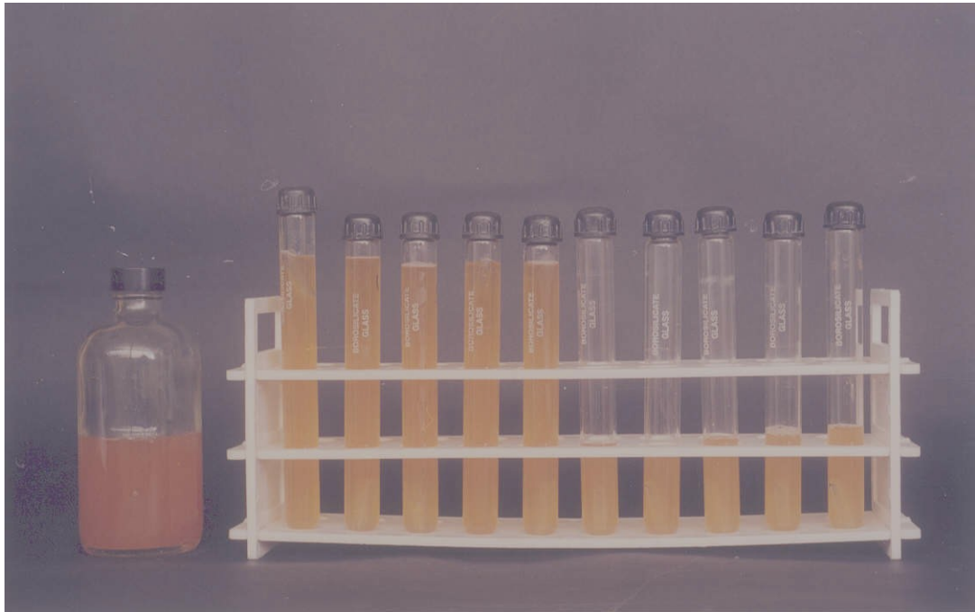
Plate (5) Example of appositive Presumptive test. Turbidity in all tubes and gas in all Durham's tubes (MPN=180)