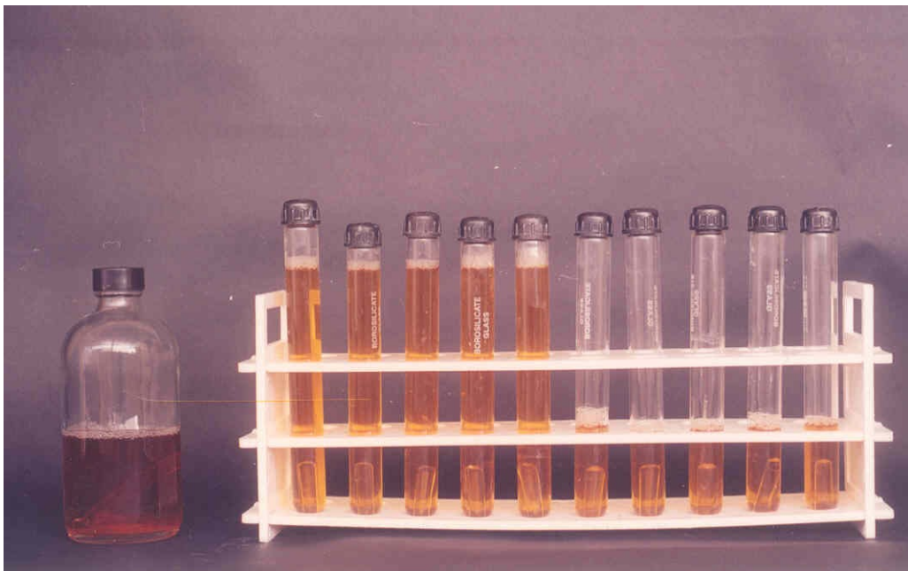
Plate (6) Example of negative Presumptive test. No turbidity in all tubes and no gas production in all Durham's tubes (MPN=0)