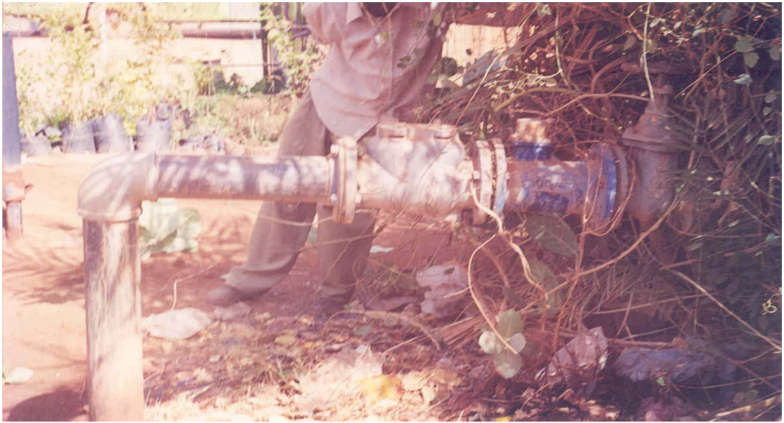
Plate (3) well from which samples were collected