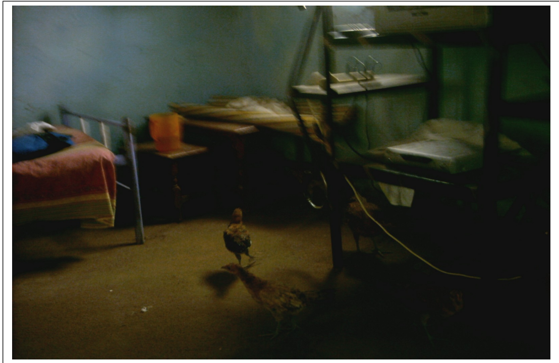
Chickens scavenging on the living room