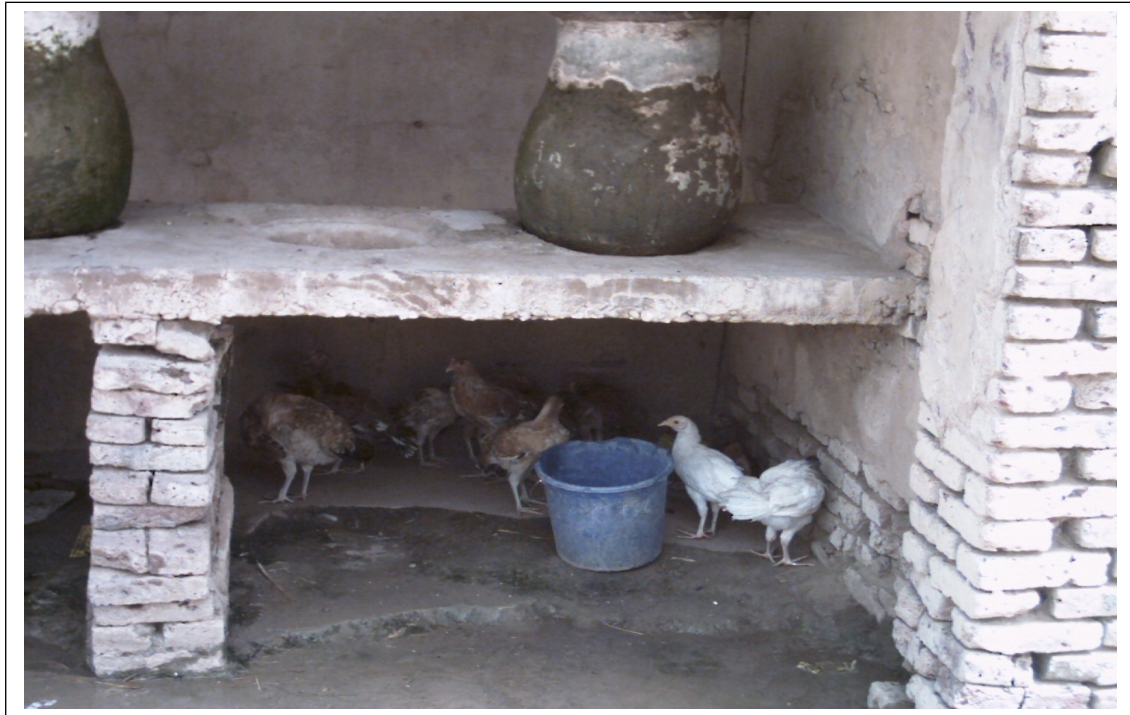
Plastic container placed under Zeer used as reservoir to receive water droppings and act as drinkers