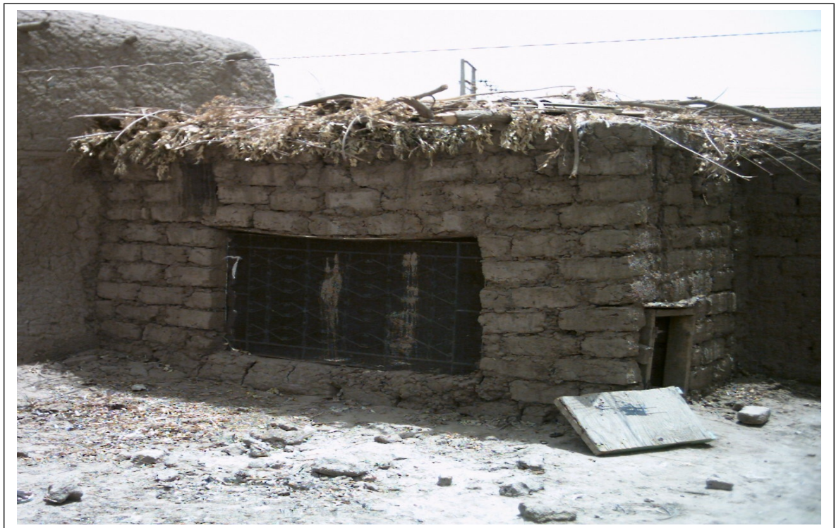
Poultry Unit made from green bricks with large window made from wire netting