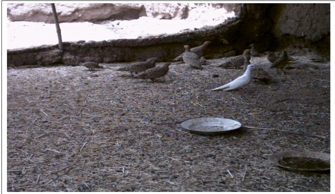
Kitchen dishes used as drinkers and feeders