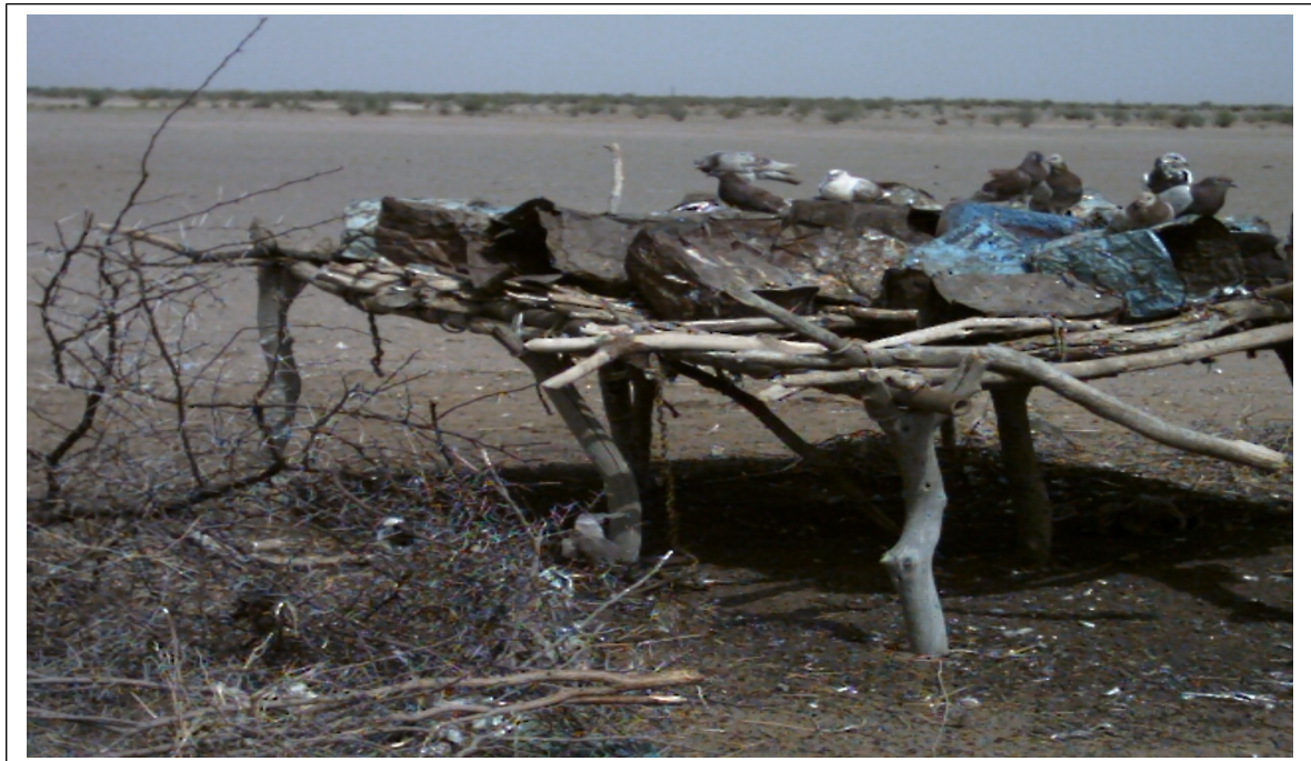
Shelter from trees branches constructed to accommodate both chicken and pigeons