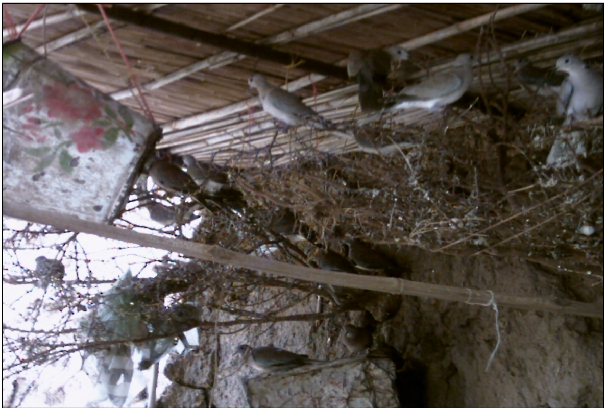
Tins and other containers used as houses for some ornamental birds