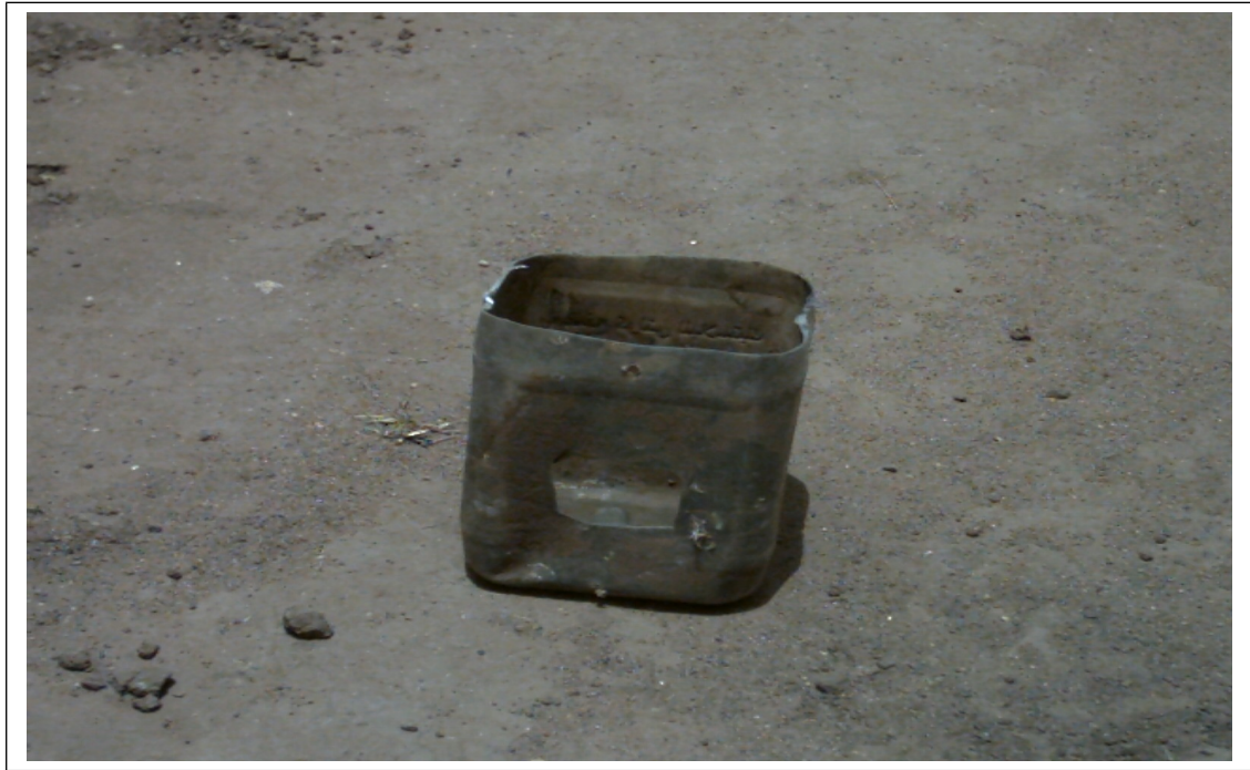
Plastic container used for layers to lay eggs