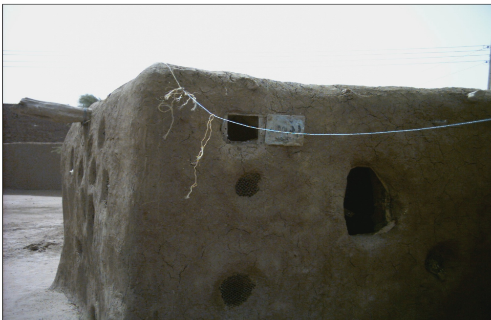
Poultry House Build from mud