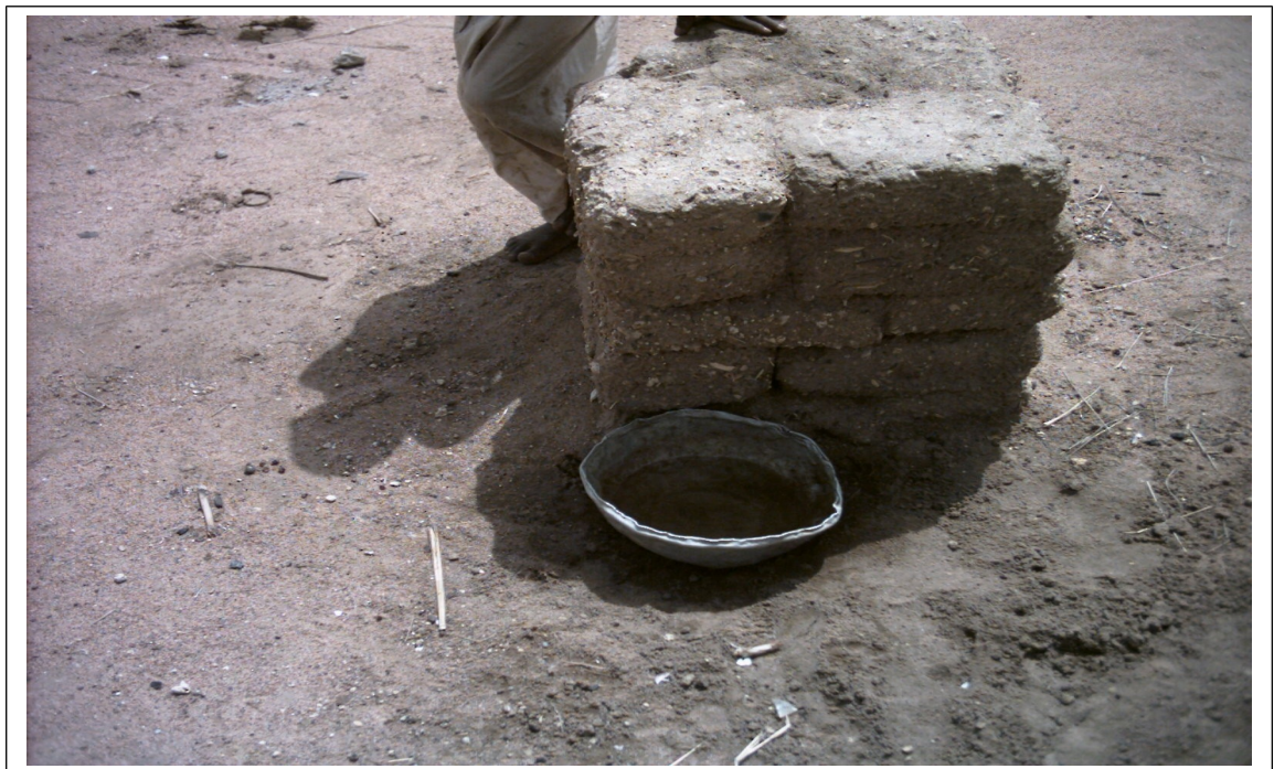
Kitchen container used as drinker