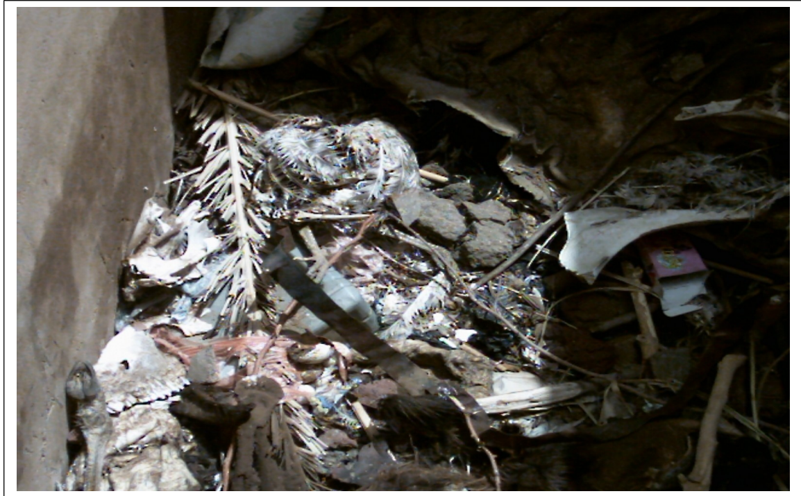
Residues of chickens burned due to disease out break