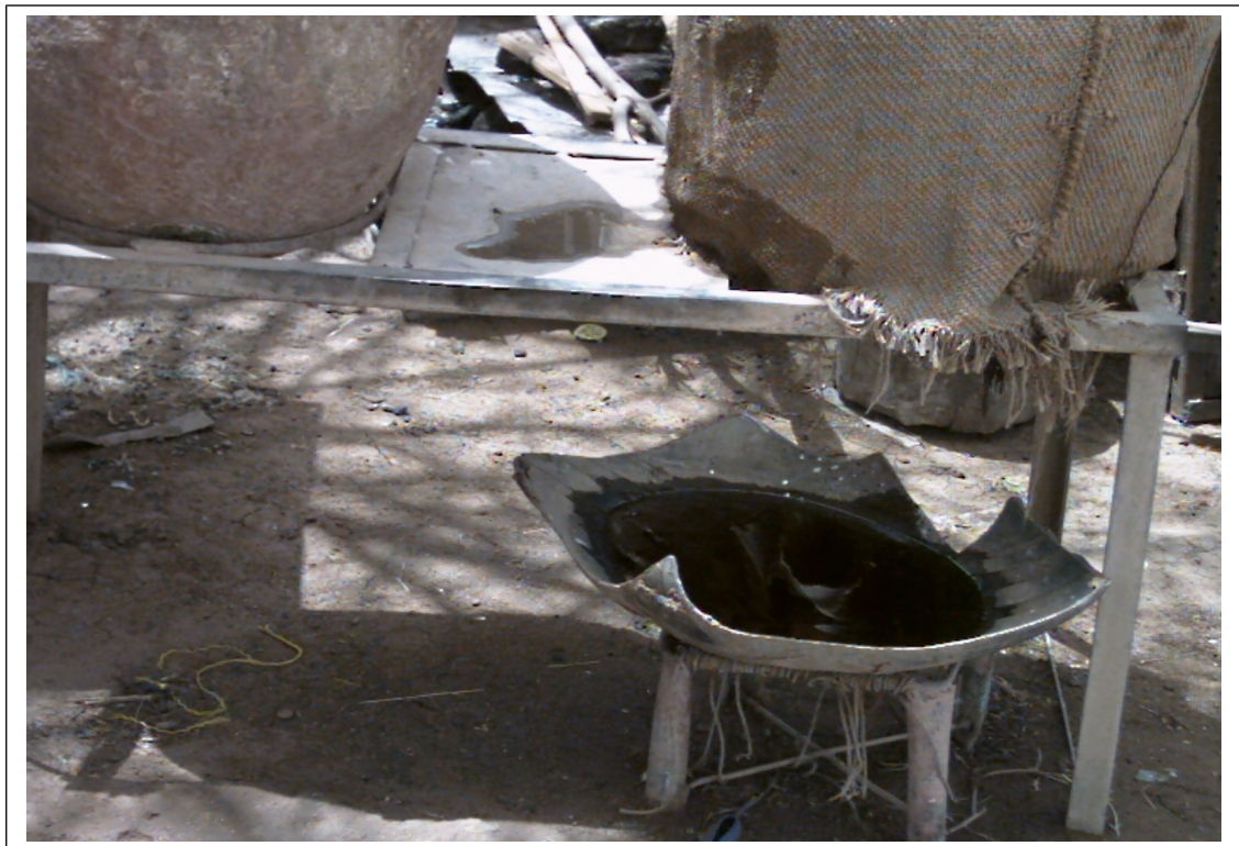
Local materials used as drinkers