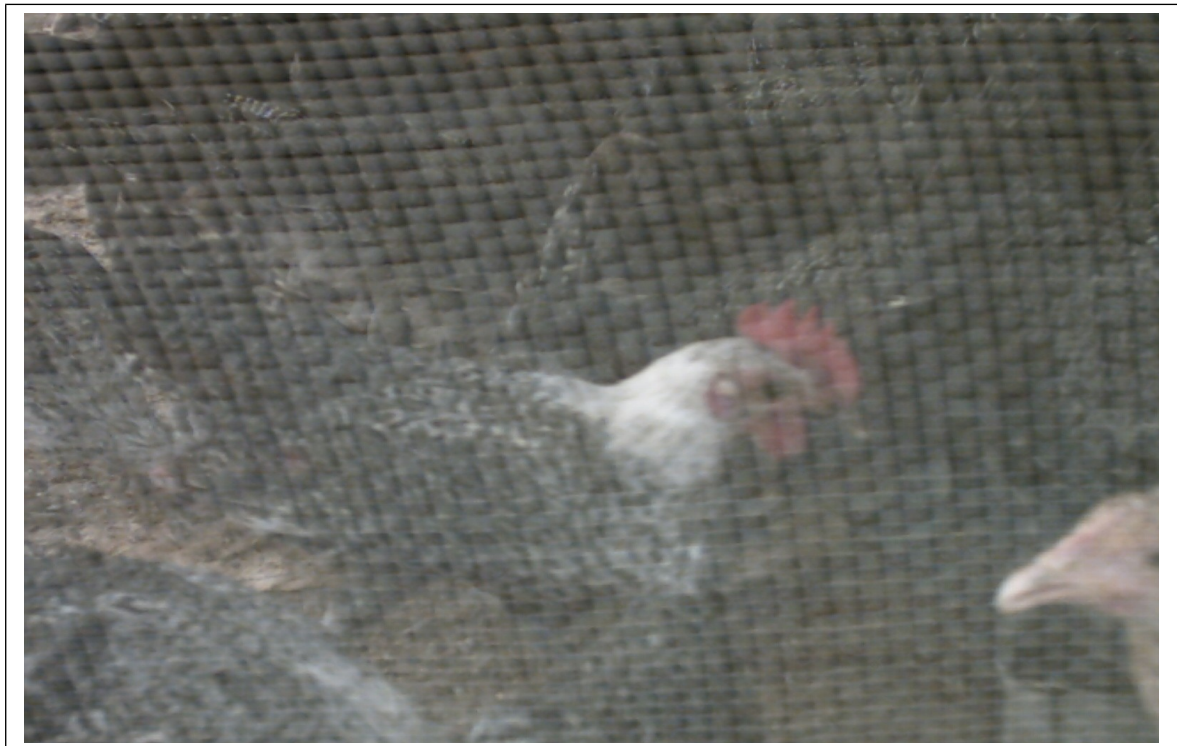
Fayomi Foreign breed