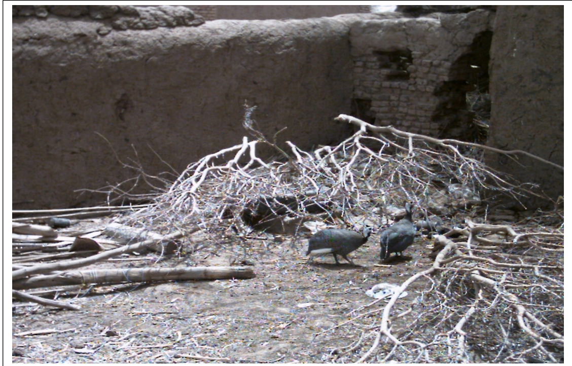
Guinea Fowl reared together with chicken