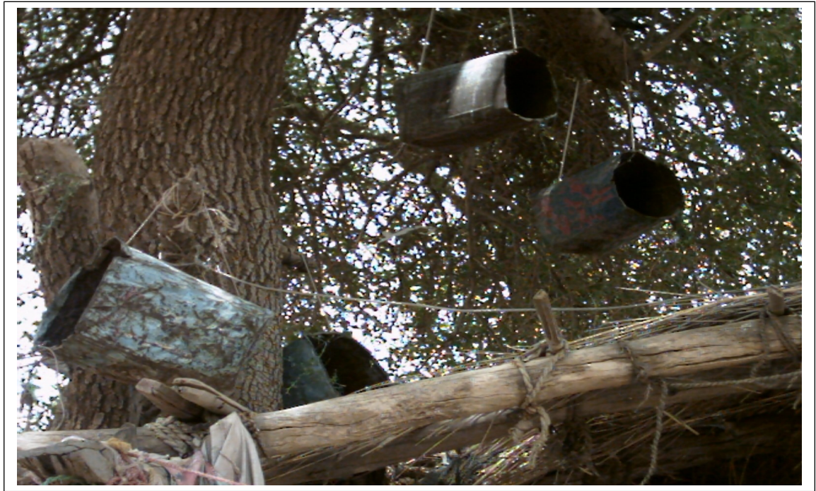
Plastic containers and tins tied to trees to accommodate pigeons