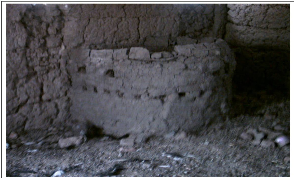
Poultry Unit made from mud with small holes to allow ventilation