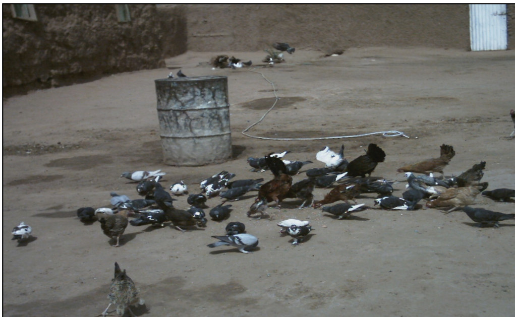
Chicken and pigeons feeding together on sorghum grains