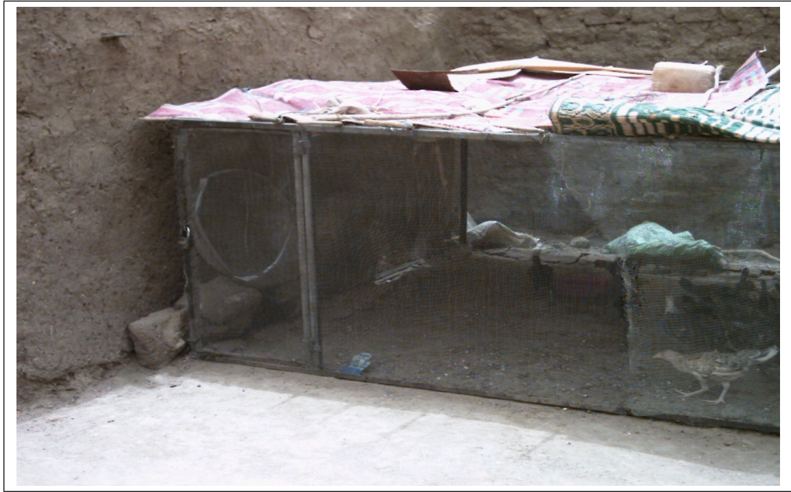
Poultry unit made from wire netting and other local materials