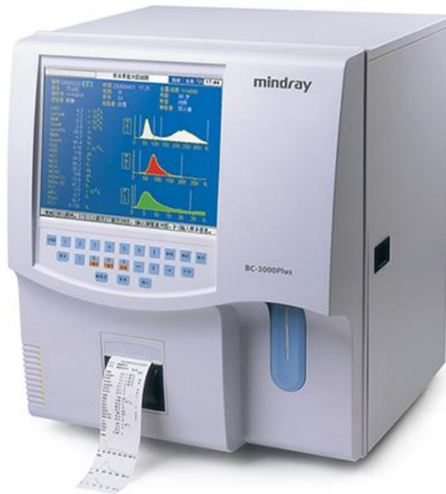
BC-3000 Plus Auto Hematology Analyzer