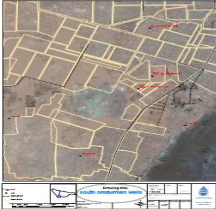
Figure (1.2): Location of the Study Area