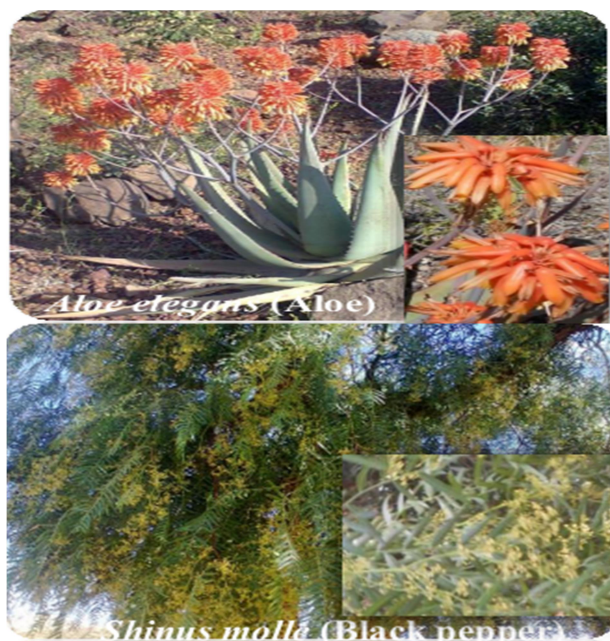
Figure 3 Some of the honeybee forages in Shketi, Temajila and Adi-sherefeto