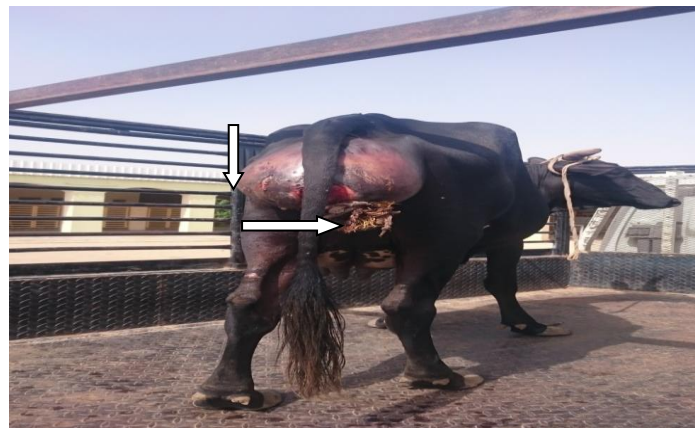
Figure 14: A cow with vaginal and urinary bladder prolapse

examined and it was found to be complicated as it was accompanied with urinary bladder prolapse. This condition was fixed, but the vagina and vulva were seriously affected.