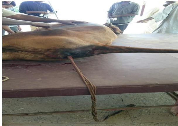
Figure 15: A dirty rope is tied to the fetus

Also a cow suffering from dystocia, was brought to the TVH with a complain of an emphysematous dead fetus. Fetotomy was wrongly applied by the labours using unsterilized knives, the fore- limbs of the foetus were amputated and a sharp object was inserted inside its tongue to pull it during the maneuver (Figure 16), which resulted in injured and ruptured uterus of the dam. Finally this case was professionally dealt with by cesarean section and the ruptured part of uterus was sutured. However, the birth canal was extremely damaged and the owner was advised to take the cow to the slaughterhouse later. All these obstetrical conflicts, created by wrong interventions, interfered with animals' comfort and welfare. Whilst