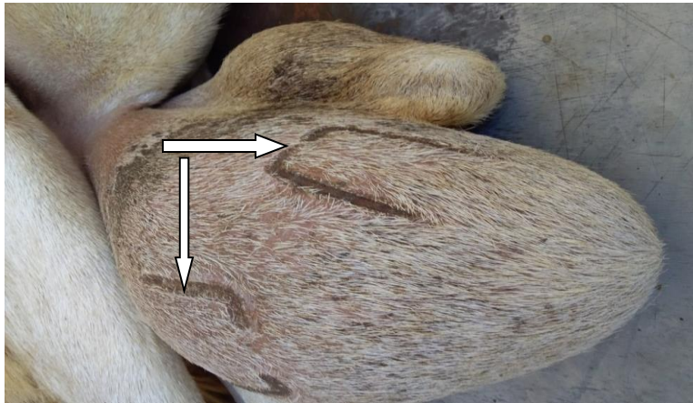
Figure 12a: Testicular burning (Orchitis).

Similarly, this traditional method of burning was applied also when owners notice swollen scrotal sacs, where they perform burning in different ways (Figure 12a&b) to alleviate this condition. In such cases uni or bilateral castration was performed.