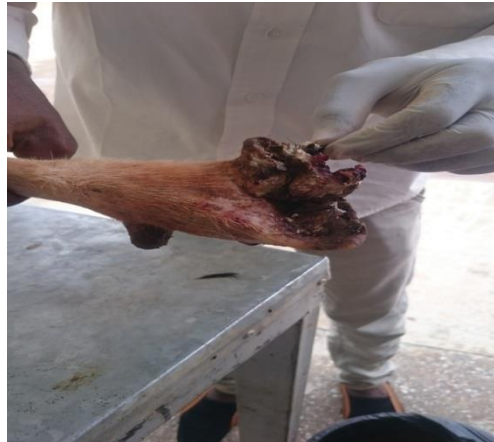
Figure 4: A goat with a rotten foot

Delaying simple acute wounds by the interference of non-professionals may end with organs loss and economical disasters. These cases suffered from acute distress