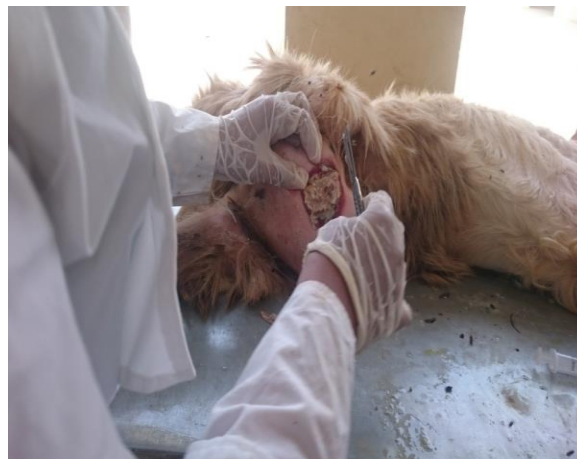
Figure 5: A goat with gangrenous mastitis

where animals try to escape from stressors, but in chronic distress animals are engaged in a mal- adaptive behavior which alters their welfare (IASP, 1979, ILAR, 1992).