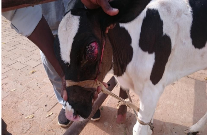
Figure 6: A calf with eye tumor

This lesion usually begins as benign and on delay they may progress to papilloma and squamous cell carcinoma ( Fornazari et al.,2017 ). The bad interference results in an aggravated case and exposure of animal to a very long period of pain, restlessness and ill-being in addition to the significant economical loss due to condemnation at slaughter house and shortened productive life. Some cases were admitted to the TVH with marks of burning by hot iron rods. To overcome signs of injury or infections, some