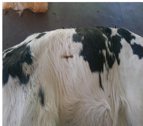
Figure 8: Burning on a calf's side

A calf suffering from stomatitis and being off food has been approached by its owner by burring its upper muzzle and the cheeks from inside (Figure 9).This calf was treated by fluid therapy, pain killer and antibiotics.