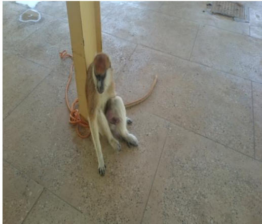
Figure 3: A monkey with thigh abscess