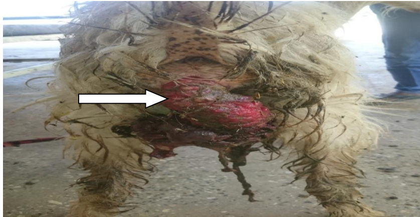
Figure 13:A goat with uterine prolapse

(Figure 13). Fortunately the uterus was not seriously damaged it was reduced, uterine pessaries were introduced and the vulva was properly sutured.