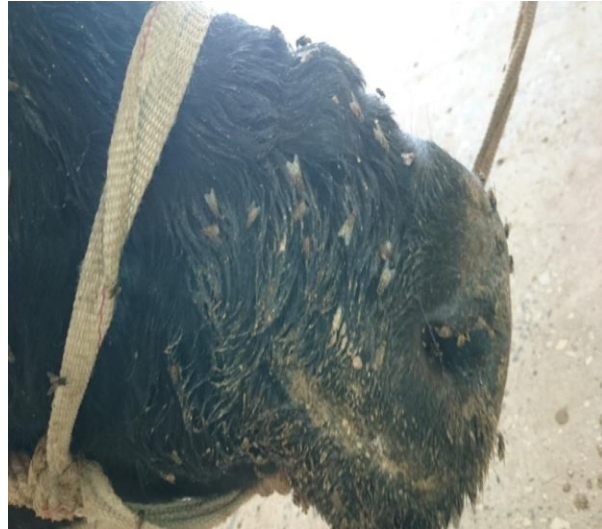
Figure 9: Burnt upper lip

Moreover, some animal's owner's burn the area around the eyes in case of eyes inflammations (Figure 10) which resulted in aggravated cases and finally eye extirpation was performed (Figure 11).