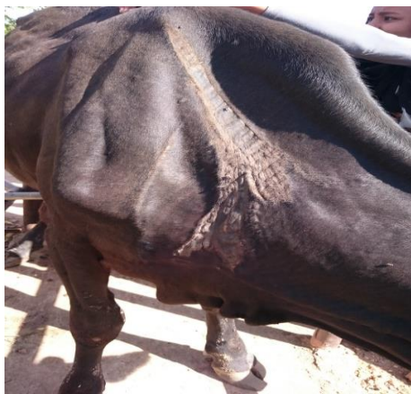
Figure 7: Burning marks, pre-scapular L.N.

animals' owners used to treat swollen lymphnodes (L.N.), where they suspect blood parasite infection, by burning (Firing) them (Figure 7). Also they may burn any parts of the animal's body (Figure 8) regarding it as the right method of treatment without any veterinary consulta-tion, which resulted in new wounds, tremendous pain and damaged hides. These cases after blood smears examination were treated by the specific drugs for different blood parasites.