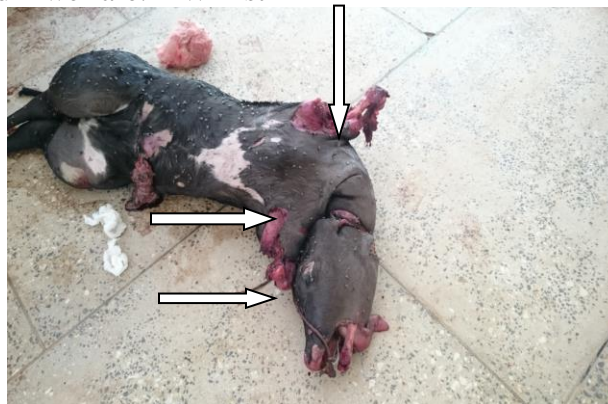
Figure 16: A dead foetus with amputated limbs and a sharp object in its tongue

welfare refers to a range in the state of the animal from very good to very poor, but whenever there is stress, welfare is poor(Broom, 1983; Broom and Johnson, 2000).In cases of dystocia dams are exposed to stress which indicates poor welfare that involves failure to cope(Selye, 1950; Selye, 1956,Etim et al. ,2013). Coping implies having control of mental and bodily stability and prolonged failure to cope results in death (Broom, 2001). Both misdiagnosis and mistreatment of females' obstetrical conditions compromise welfare and have serious impacts on females' reproductive performance and consequently their general production which will lead to great economical losses (Etim et al. ,2013).