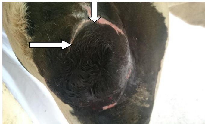
Figure 10: Burnt area around the inflamed eye

Moreover, some animal's owner's burn the area around the eyes in case of eyes inflammations (Figure 10) which resulted in aggravated cases and finally eye extirpation was performed (Figure 11).