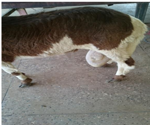
Figure 1: A ram with unilateral scrotal hernia

treated by their owners and turned to chronic cases. A ram suffering from delayed unilateral scrotal hernia (Intestine) associated with adhesions, was presented (Figure1)a surgical operation was performed for reduction of the intestinal contents and partial removal of the atrophied testis. Similarly castration was done to a ram with a previous history of acute unilateral orchitis which was neglected and turned to a chronic case (Figure2). In these cases animal rights are violated as they are exposed to pain and potential tissue damage (IASP,1979). Moreover, these conditions may result in infertile males due to the high temperature produced. High temperature affects the adjacent testis ending with testicular degeneration and reproductive loss in the farm (Parkinson and McGowan, 2019).