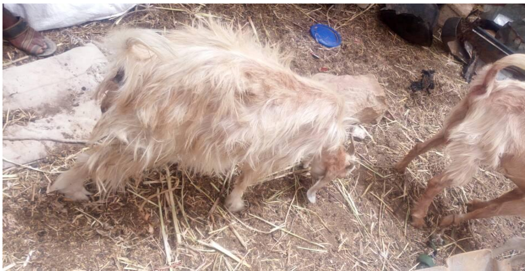
Figure 1: Goat (positive group) showing rough hair coat and emaciation.

Sheep and goat in the positive group showed multiple clinical signs. These included scratching themselves by their teeth, hind hooves and horns. In extreme cases, affected animals rubbed on walls of shelters, fence posts and any solid object. Decreased feed intake, resulting in decreased weight gains and milk production. Their skin showed rough coat, varying degrees of hair loss, scaling, thickening and wrinkling. In addition to these the eyes mucus membranes of the affected animals appeared pale (Figures 1-7). The negative animals group appeared normal.