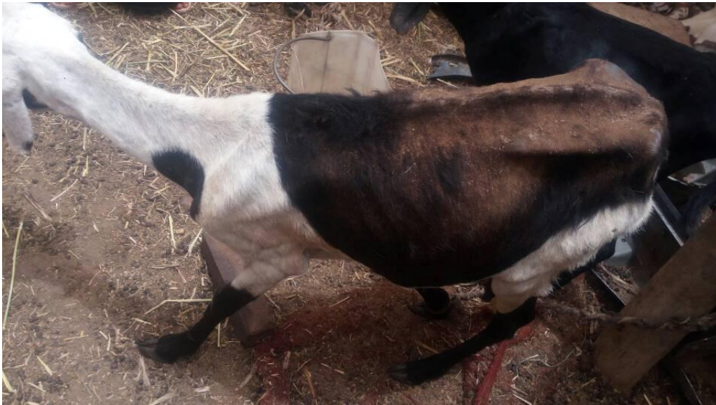
Figure 3: Sheep (positive group) showing loss of coat and emaciation.