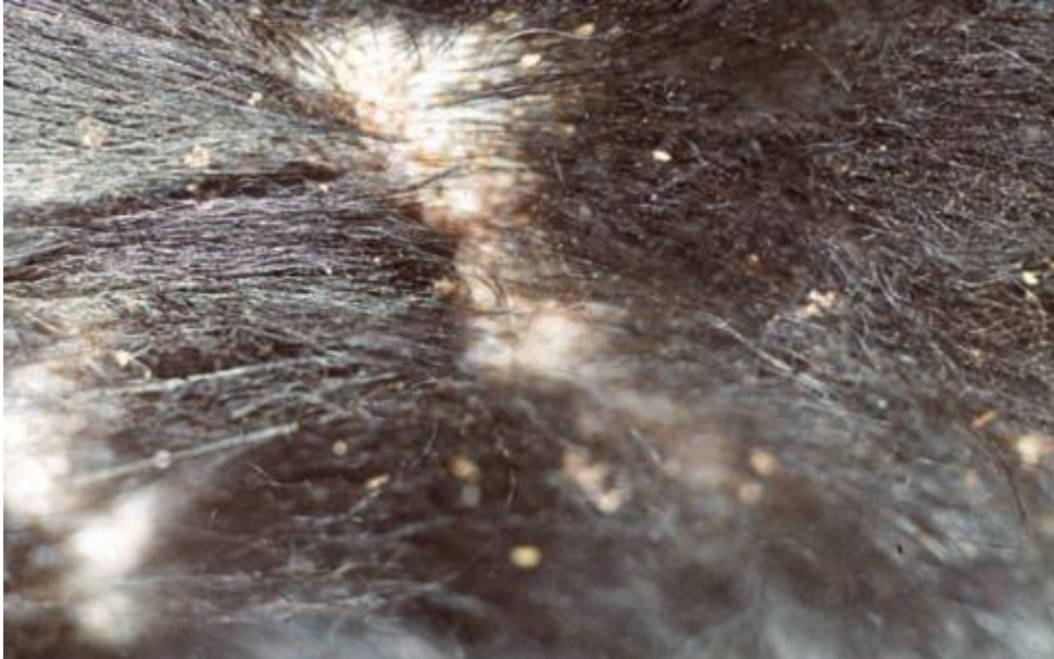
Figure 8: Goat (positive group) showing alopecia, crusts, scales and lice.