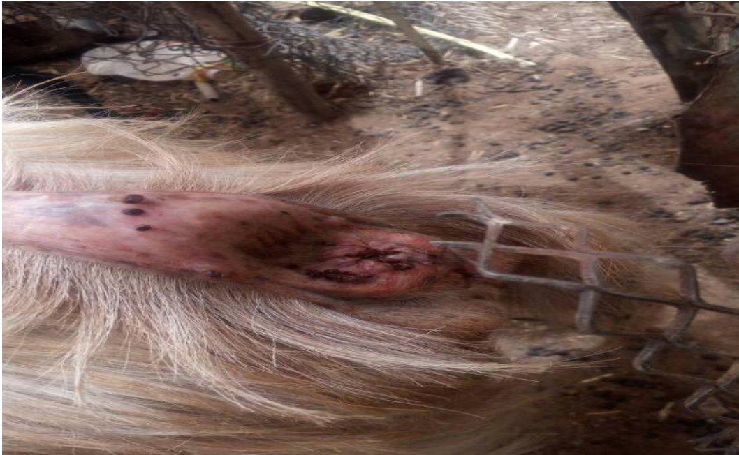
Figure 6: Goat (positive group) showing ticks in the anal region and tail