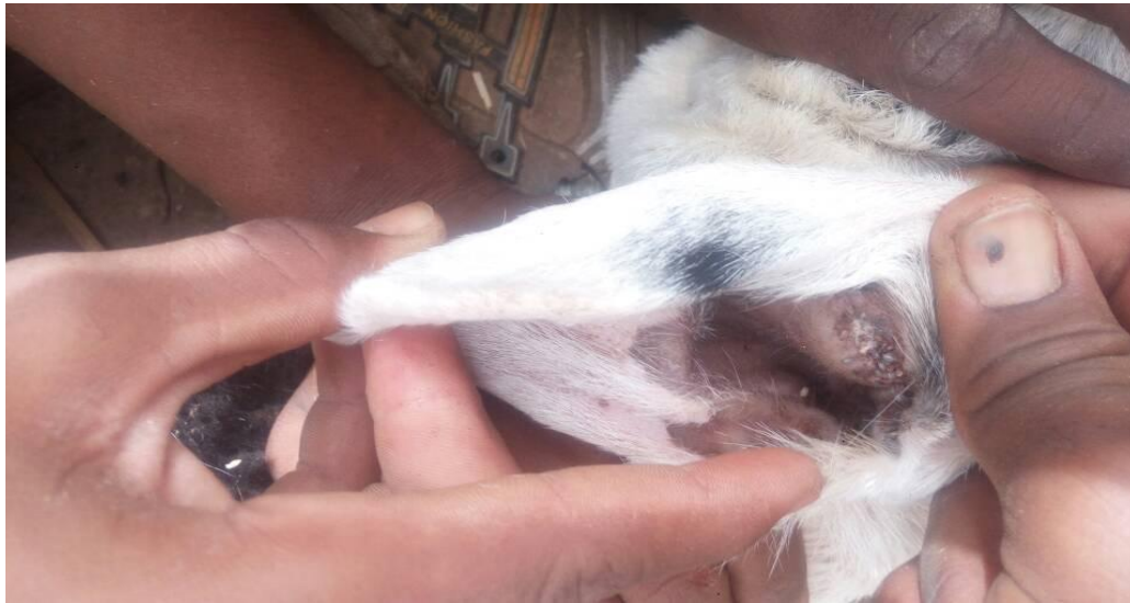
Figure 4: Sheep (positive group) showing ticks in its ear.