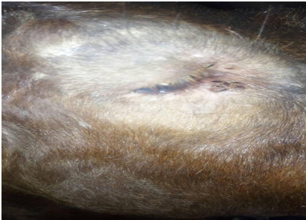
Figure 5: Sheep (positive group) showing ticks near its eye.