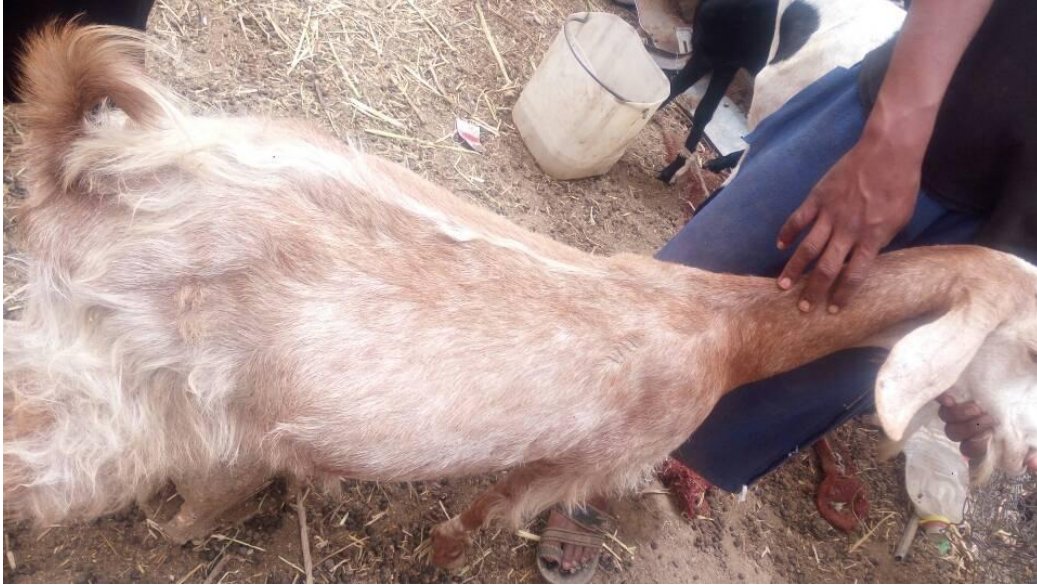
Figure2: Goat (positive group) showing loss of hair coat and emaciation.