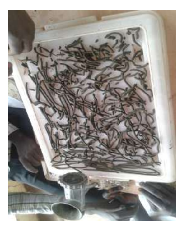
Picture(5_6): mixing large ingredient with small ingredient and pelleting ingredient