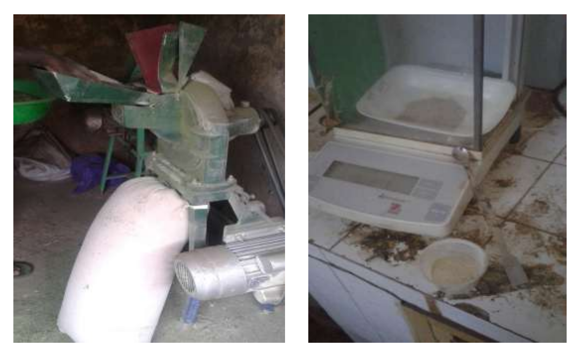
Picture (3_4): Grinding of ingredients and weighing of ingredients by sensitive balance.