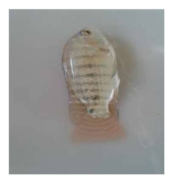
Picture (7-8): Size of Nile tilapia fries in the beginning experimental and size after end of experimental.