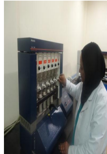
Plate(16) soxtec for fat