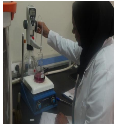
Plate (4) Titration unit