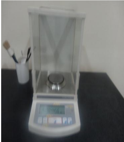
Plate (1) Balance