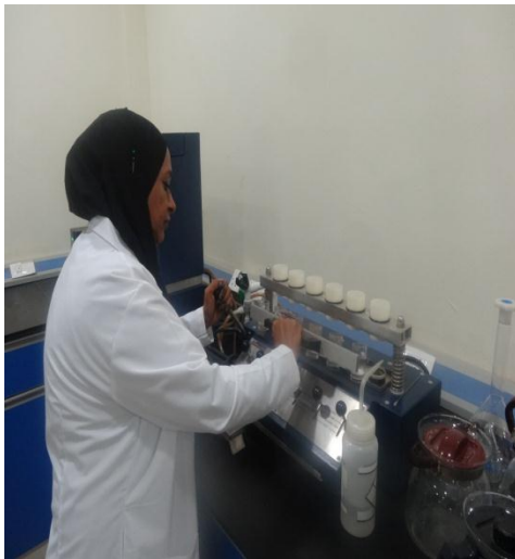
Plate (7) fiber cold extraction unit