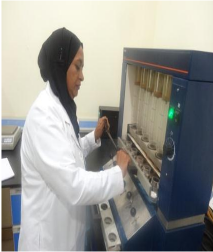
Plate (5) fiber(hot extraction unit)