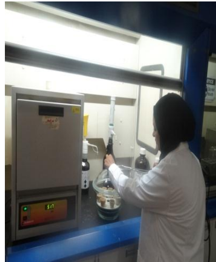
Plate (10) ash extraction