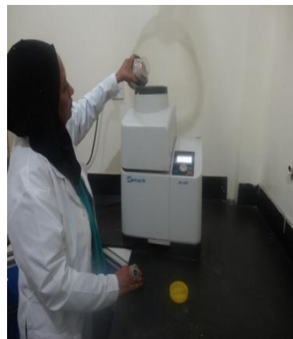
Plate (12) grinding machine