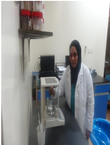
Plate(15) weighing samples