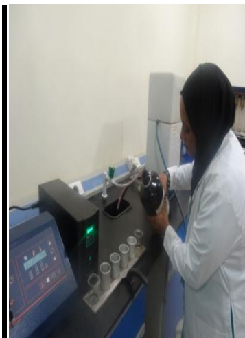
Plate (11) fat unit