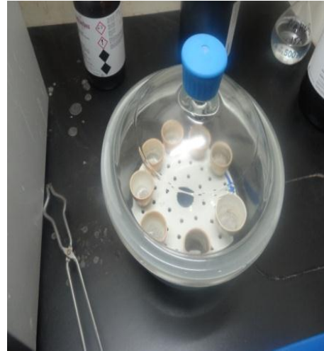
Plate (2) Desicator