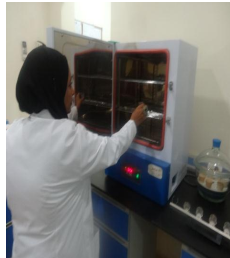
Plate(8)oven moisture 103