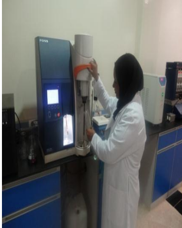
Plate (13) ) kjeltec for protein