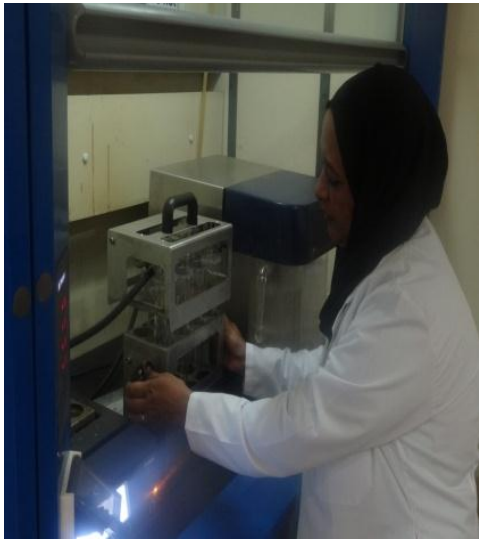
Plate (9) Digester (protein)