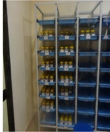
Plate (6) samples store