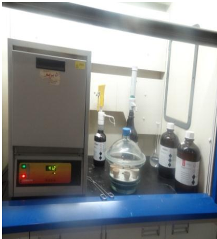
Plate (3) oven 550 for ash