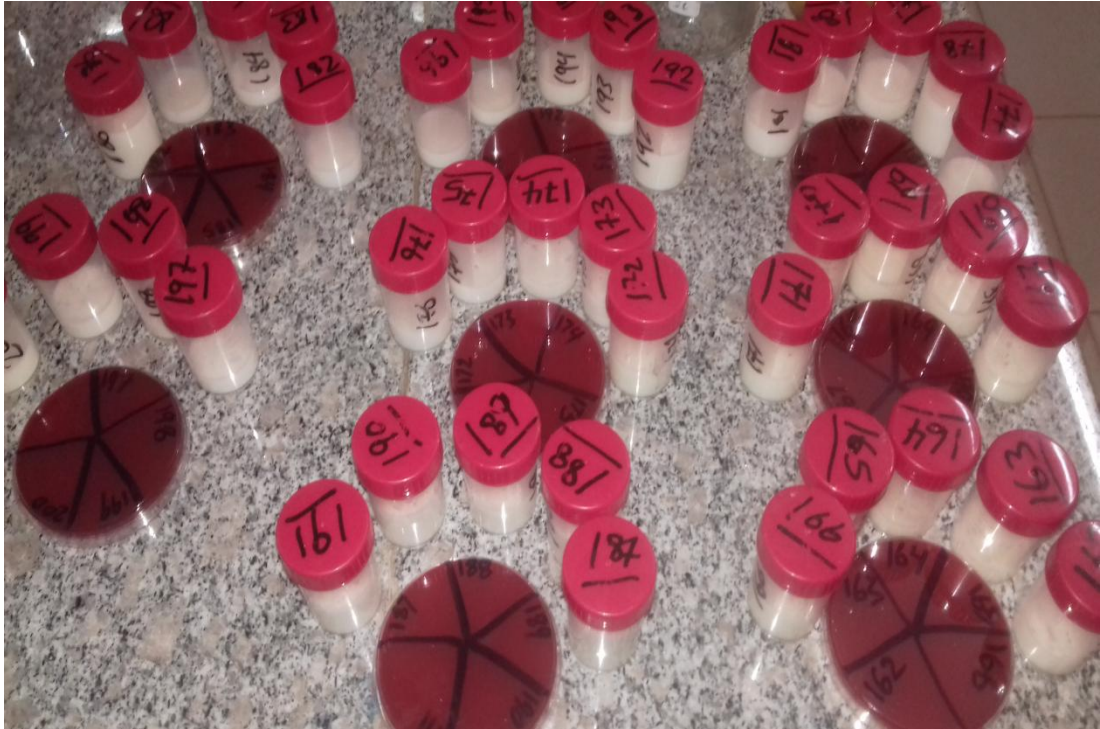
Colour plate (I.1): milk samples and plates of Columbia blood agar.