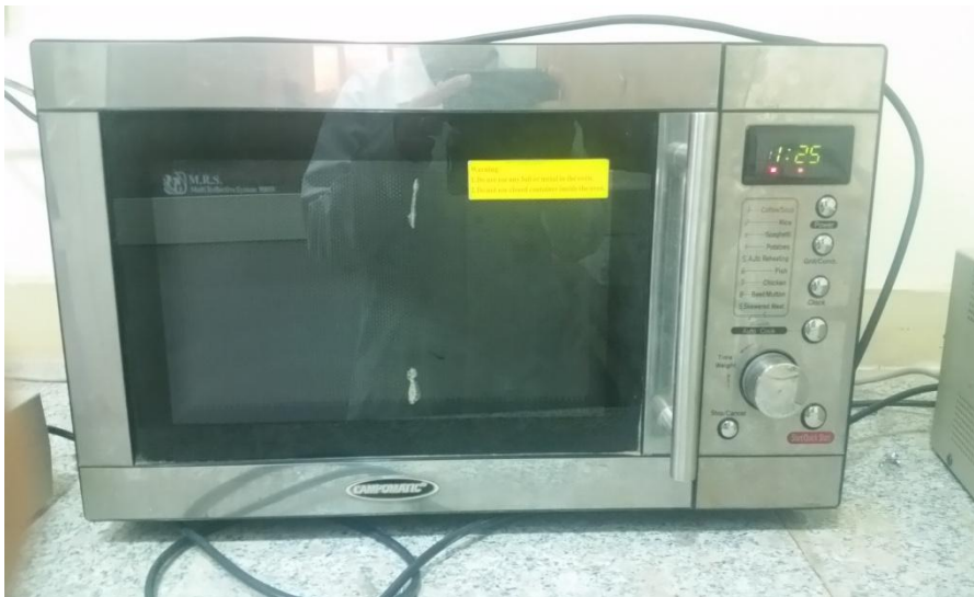
Colour plate (I.2): Microwave.