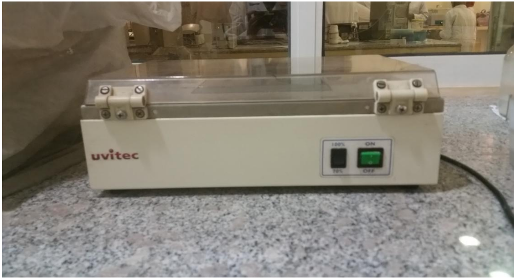
Color plate (I.5): Tran-illuminator