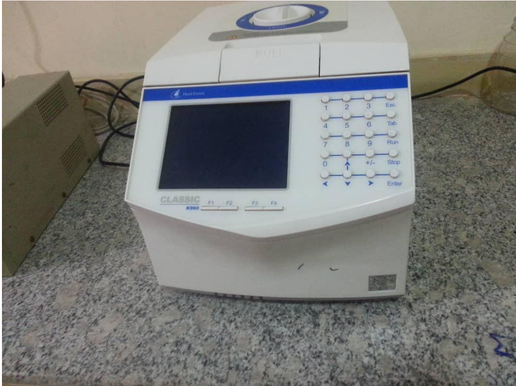
Color plate (I.3): Thermo-cycler.