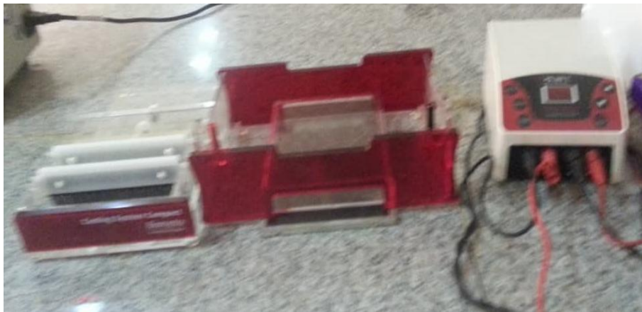
Color plate (I.4): Electrophoresis system.