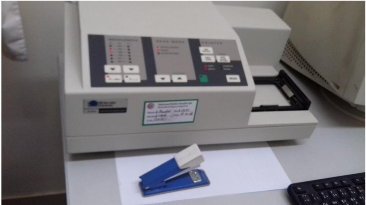
Figure 2: Microwell plate reader ( Thermo Scientific ).