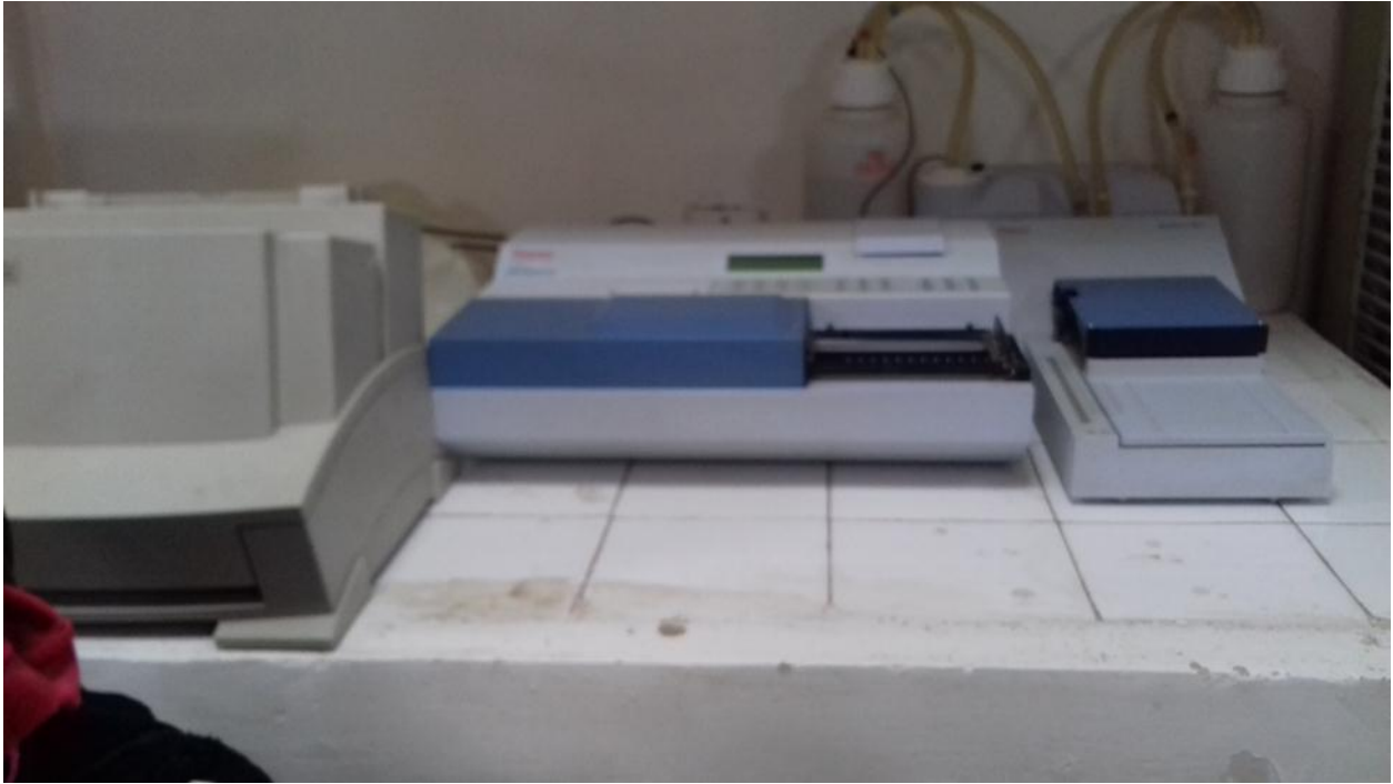
Figure 3: Microwell plate washer ( Thermo Scientific ).