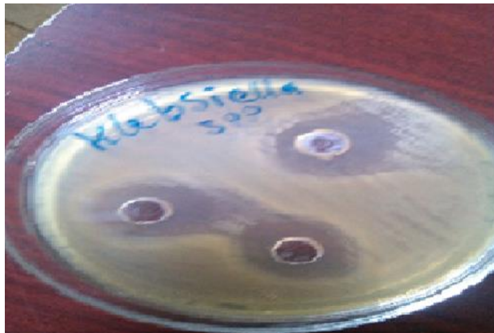
showing the zone of the inhibition of L. acidophilus of K. pneumoniae