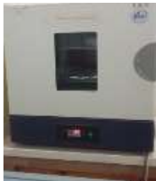
Plate(2): Oven to use of dry samples