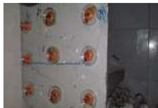
Plate(4): orange covered with honey

Samples honey were collected from the(sennar) and (el-soki),and samples orang from the central market of bahri ,and covered with honey and then treated with fangus ( Penicillium digitatum ) compared with control ,the first reading was taken after 48 hours the beginning of experiment and then after 24 hours of five dayes