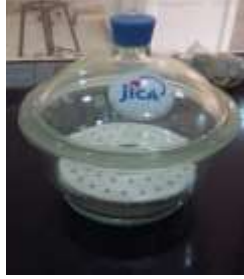
Plate(3): Destecator used keeping of the samples before extracting from oven