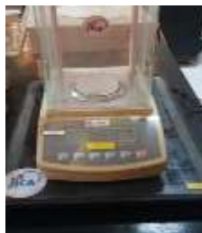
Plate(1): Sensetive Balance used to weighting of samples

Lab coat _ gloves_ gags_ Petri dishes 9_ sensitive balance_ Desecrator _ oven_ laminar flow_ needle_