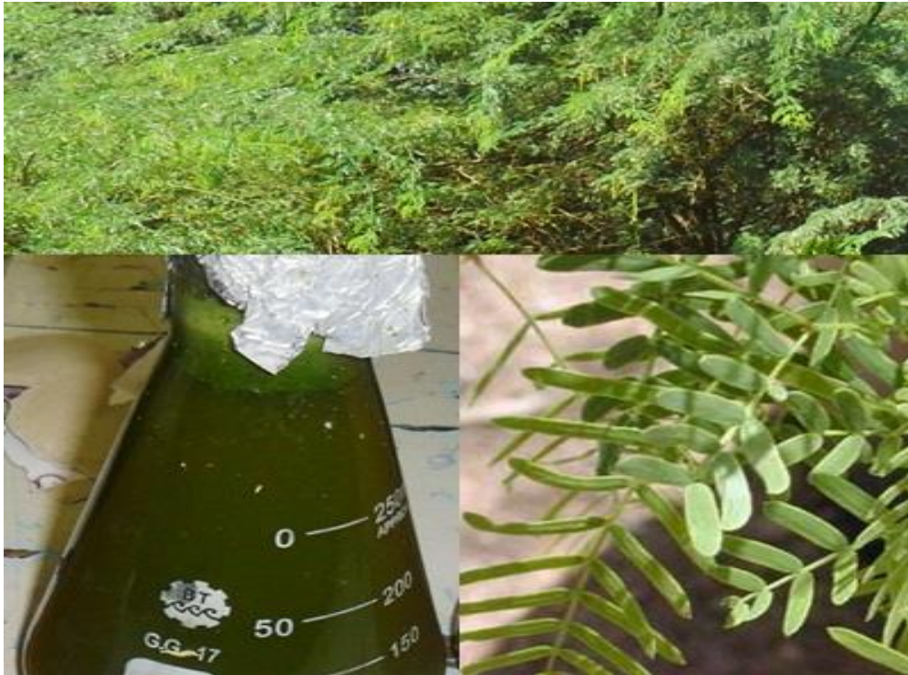
Plate 1: The aqueous extracts of mesquite leaves.