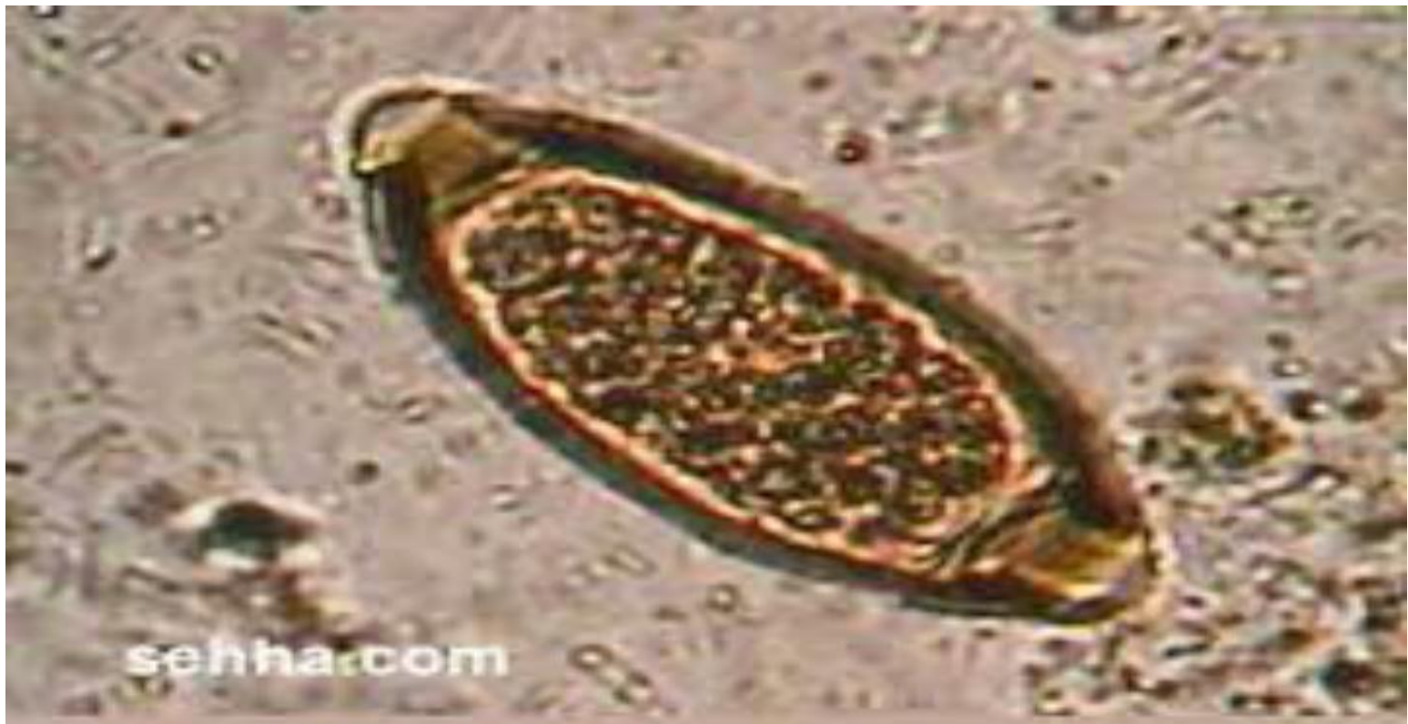
Plate: 1 Trichurs sp Egg