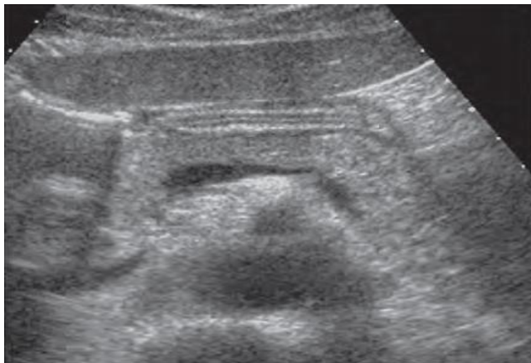
Appendix (A-2) Ultrasound image Transverse image for Female patient have 28 years old show normal pancreas in parenchymal echogenicity and size.