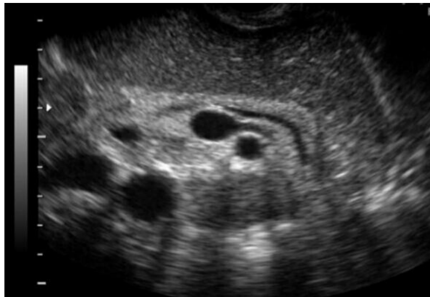
Appendix (A-4) Ultrasound image transverse image for male patient have 55years old with hyperechoic paryncema of pancreas.