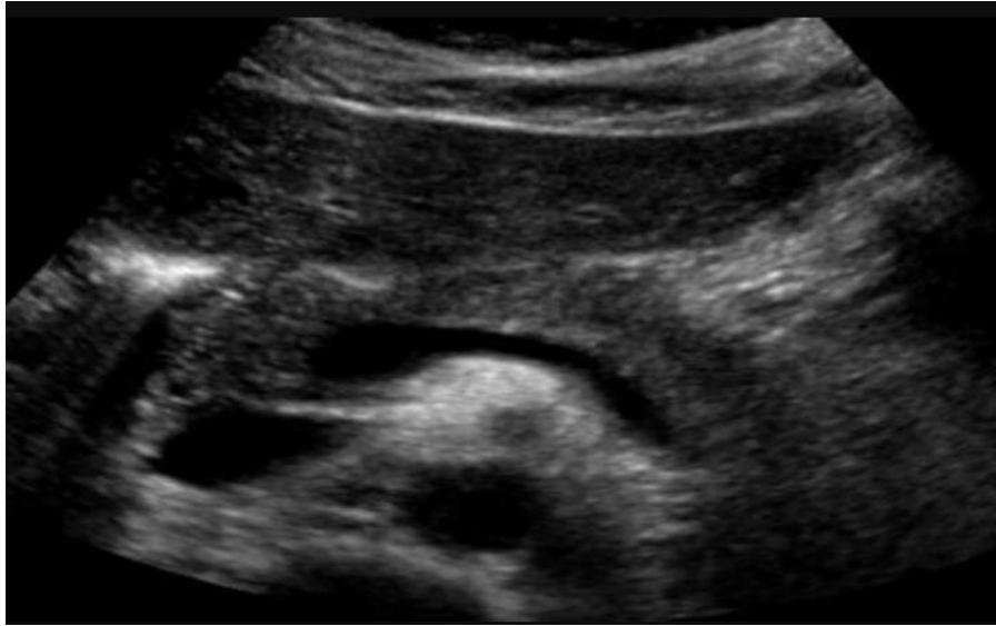
Appendix (A-3) Ultrasound image transverse image for Female patient have 38 years old show hypoechoic smooth regular out line of pancreas.