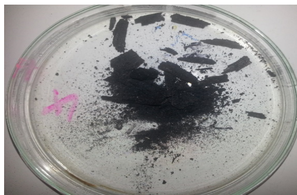
Figure 2, granular AC

Three grams of raw material was impregnated with concentrated orthophosphoric acid (95% w/v) at constant ratios of acid/raw material (2: 1). The first step of activation and carbonization process, was impregnated samples in the acid, then burned in carbolated furnace (CW1200) for 1.5 h and 2 h, at 600°C, 650°C and 700°C with loading time 35 min and heating rate 50°C/min. After cooling to the room temperature, the samples were washed with distilled water to remove any residual phosphoric acid. This was done by washing the carbon with 80-90°C distilled water for several times until remove any acid remains, then filtered through What man filter paper No.3 and dried in the GENLAB oven at 105°C for 2h. The samples were weighed in order to determine the yield of activated. The dried samples were granulated and then stored in air tight bottles ready for use, Figures 2 and 3 below showed granular AC and AC block diagram respectively.