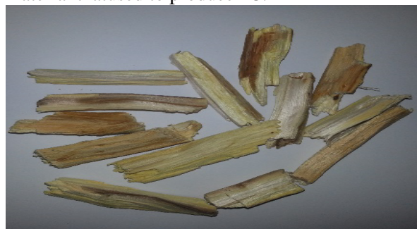
Figure 1: Raw material of AC from Mesquite tress.

We will use Mesquite trees to generate activated carbon, because it is cheaper than the above kind, and also helping the agriculture lands from the problem of Mesquite trees. Figure 1 shows the raw material that used to produce AC.