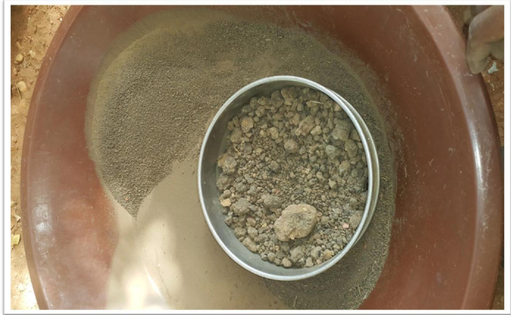
Fig. (1) Soil sample