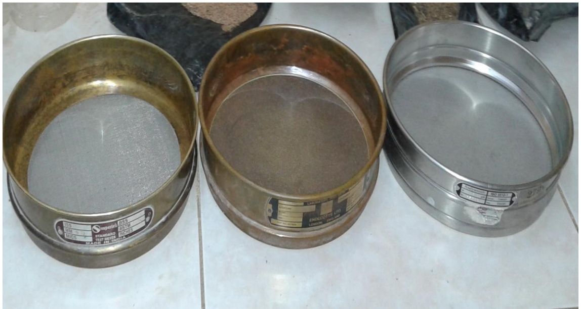
Fig. (2). Sieves graded diameters