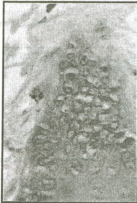
Fig.8. Vacuolated cells with eosinophilic intracytoplasmic inclusion bodies

The inclusion bodies were visible in affected epithelial cells. These were demonstrated as vacuolated cells with eosinophilic intracytoplasmic inclusions (Fig. 8).