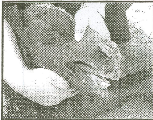
Fig. (2): Pustules on the lips, muzzles, nostrils and on the eyelids and peri-orbital area of a camel calf.

Macroscopically: the lesions were the classic ones of pox with vesicles, pustules and scabs. These were observed on the lips, buccal mucosa, around nostrils and on and around the eyelids (Fig. 2 and 3). They were also found on the internal sides of the thighs which had fine skin and on the external sides of them if alopecia attributed to rubbing has occurred. However, the lesions were palpated and identified when the thighs were covered by hair.