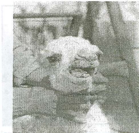
Fig. (1): Scabs on the lips, muzzles, nostrils and the eyelids of a camel calf.