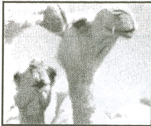
Fig. (4): Destruction and distortion of the lips, particularly the upper one, of a camel calf compared with a normal one (front)

One of the affected camel calves showed very severe mouth lesions that resulted in destruction and distortion of the lips particularly the upper one (rounded mouth) (Fig. 4). This had led to reduced ability of the lips to seize and grasp the feed.