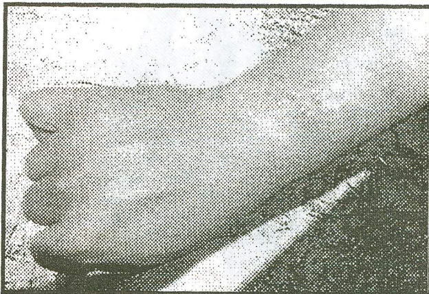
Fig. (5): Erythema and hyperaemic papules on the herdman's arm

The lesions noticed on the herdman's arm comprised localized erythema and firm raised papules with a zone of hyperaemia around the base (Fig. 5).