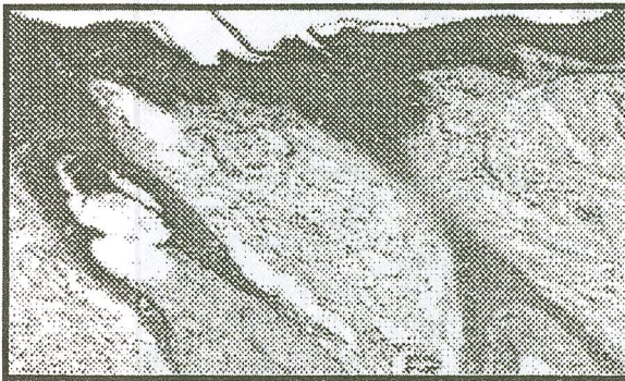
Fig. (6): Acanthosis. Note thickening of the epidermis and extension of some parts of it into the dermis

The histopathological examination was limited to the skin lesions only. The lesions in the epidermis were similar to those of other poxviruses with localized acanthosis associated with hyperkeratosis. In some parts, the thickened epidermis extended into the dermis (Fig. 6). Acanthosis was followed by vesicle formation that soon filled with neutrophils to form a pustule. Rupture of the pustule occurred within a week to 10 days. The newly ruptured pustule appeared as an empty space containing epithelial cells, neutrophils, keratin threads and a pink-staining proteinous precipitate (Fig. 7).