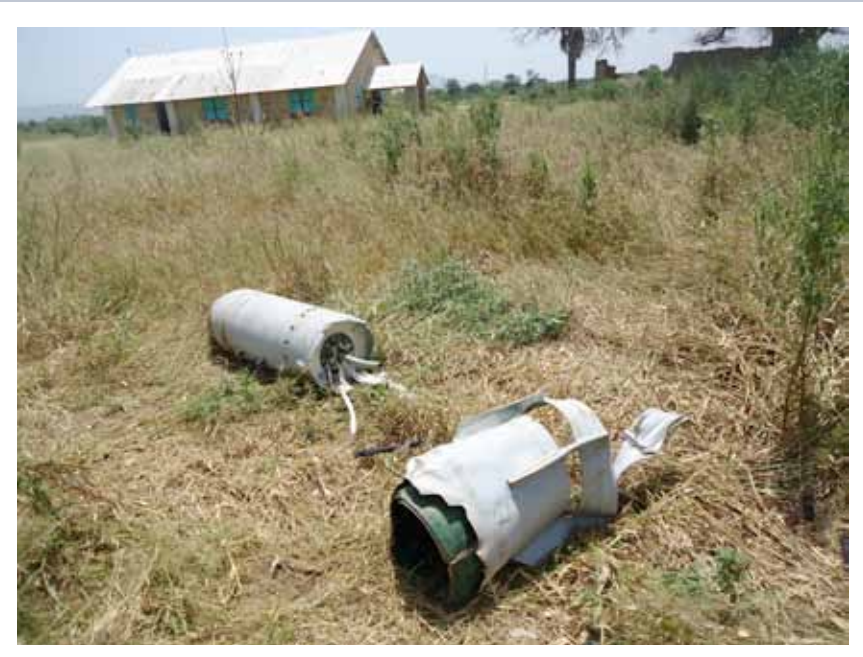
Unexploded bomb, presumably a Russian made general purpose bomb (OFAB-500) containing 126 kg of explosives, Buram locality, (Nuba Relief Rehabilitation and Development Organisation-NRRDO 2013)

The main harvest season corresponds with the beginning of the dry season, traditionally the start of new military campaigns. This period is therefore marked by a strong increase in bombardments, preventing civilians from tending to their fields. As the population has developed coping strategies such as digging foxholes and moving to areas in close proximity to caves, the direct casualties and injuries resulting from the bombardments are limited.