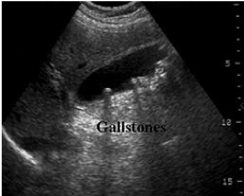
Image (6) show transverse scan with gallstones in diabetic patient