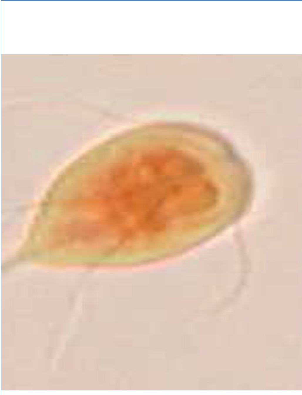
Plate No (5) Giardia Spp.