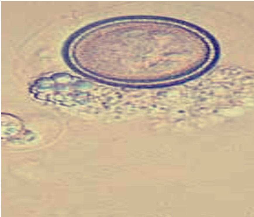
Plate No (3): Echinococcus Sp.