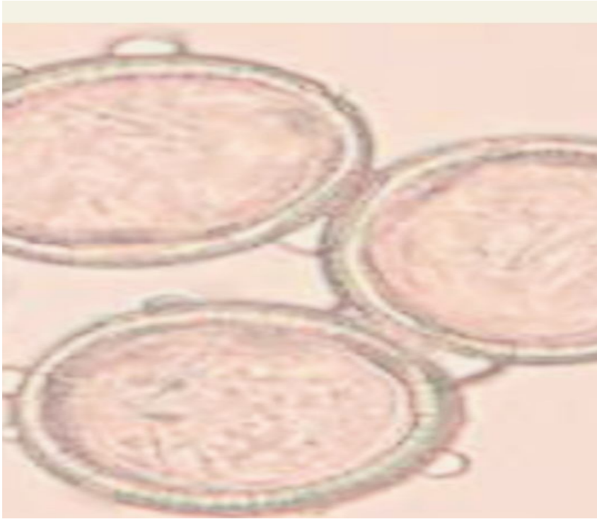
Plate No(4): Taenia Spp.