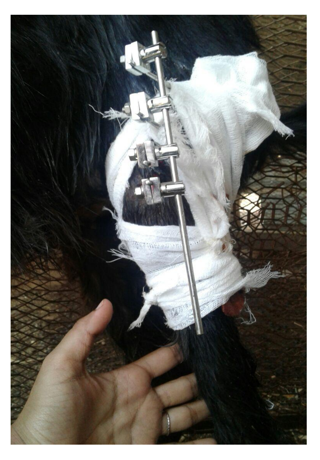
Figure 3:goat no (2) external fixation (Pin tract draing).