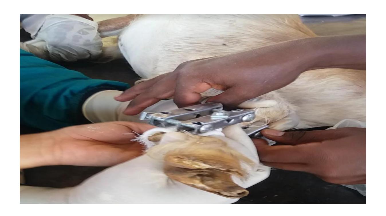
Figure1:goat no (1) external fixation.