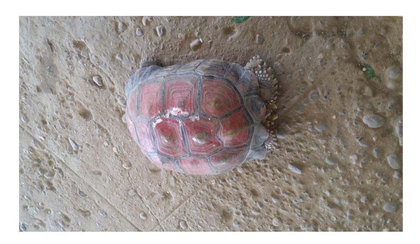
Turtle withTrauma in leg