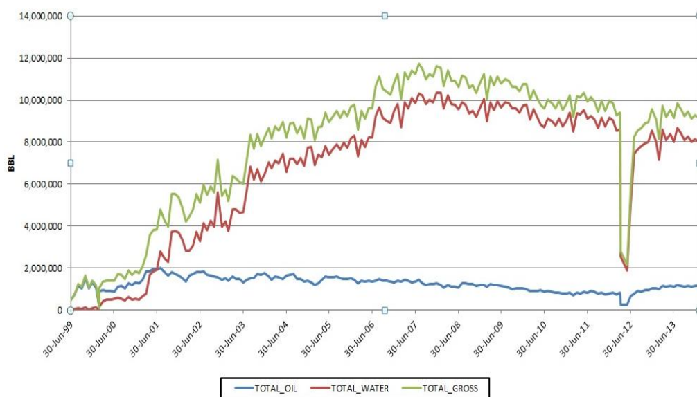
Plate 1.3 Total of Water Production from 1999 Up To 2013 (Production Performance & Challenges GNPOC 2014)