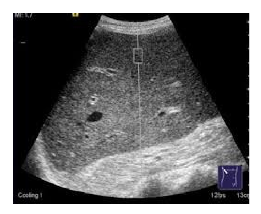
Appendix (A.6). Ultrasound image of 55 years male patient with acute hepatitis (C) shows homogeneous, .enlarged liver with diffusely hypo echoic echo pattern