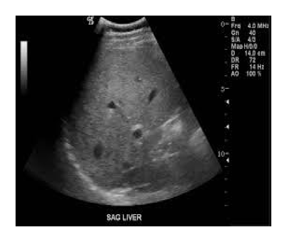
Appendix (A.3). Ultrasound image of 46 years male patient with acute hepatitis (B) shows homogeneous, enlarged liver with diffusely hypo echoic echo pattern