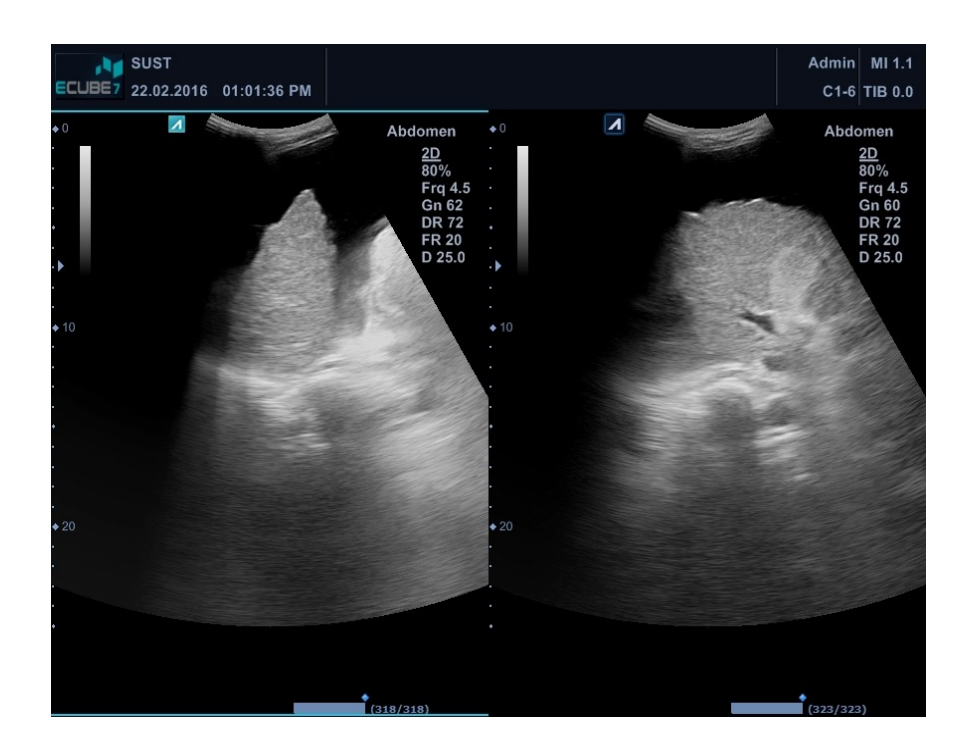
Appendix (A.8). Ultrasound images of 26 years female patient with Liver cirrhosis shows