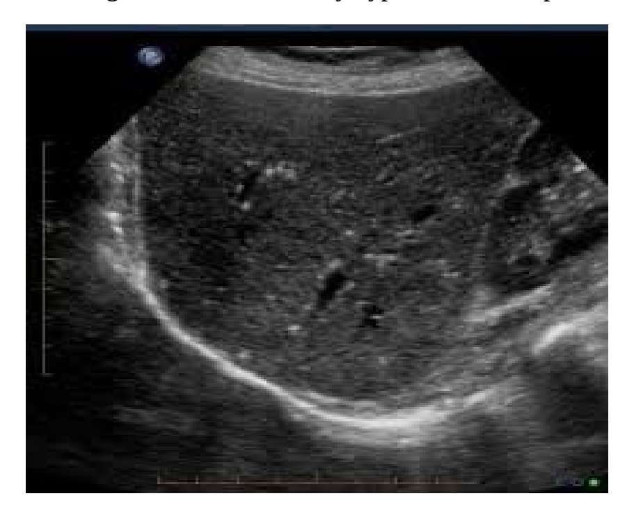
Appendix (A.4). Ultrasound image of 55 years male patient with acute hepatitis (B) shows homogeneous, .enlarged liver with diffusely hypo echoic echo pattern