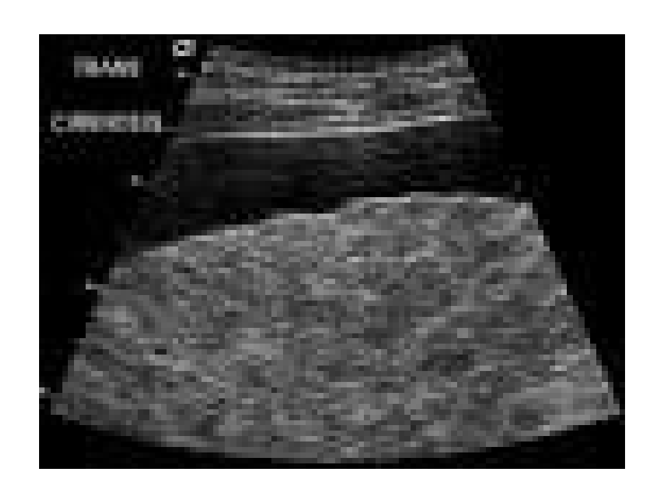
Appendix (A.7). Ultrasound image of 58 years male patient with Liver cirrhosis shows heterogeneous echo pattern (Coarse texture), .shrunken liver with ascites