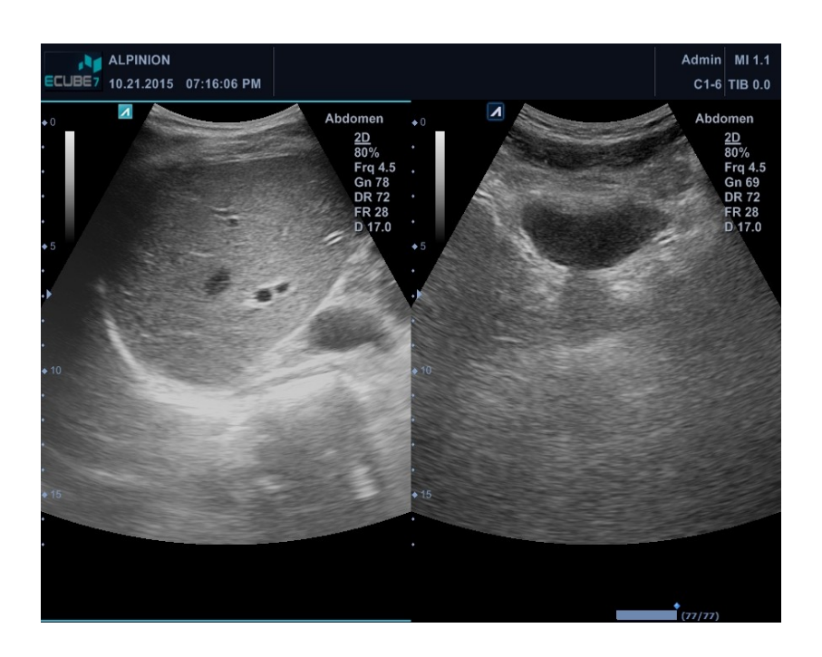
Appendix (A.2). Ultrasound image of 33years male .patient of normal liver shows homogeneous echo pattern

Appendix (A.2). Ultrasound image of 55years male .patient of normal liver shows homogeneous echo pattern