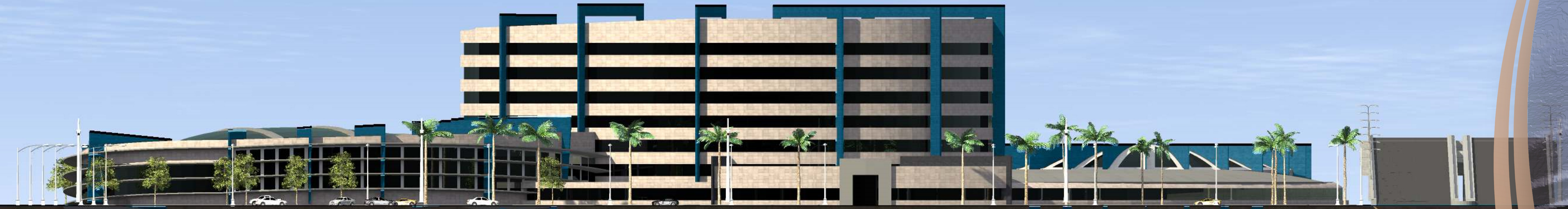
North Elevation Scale 1:300