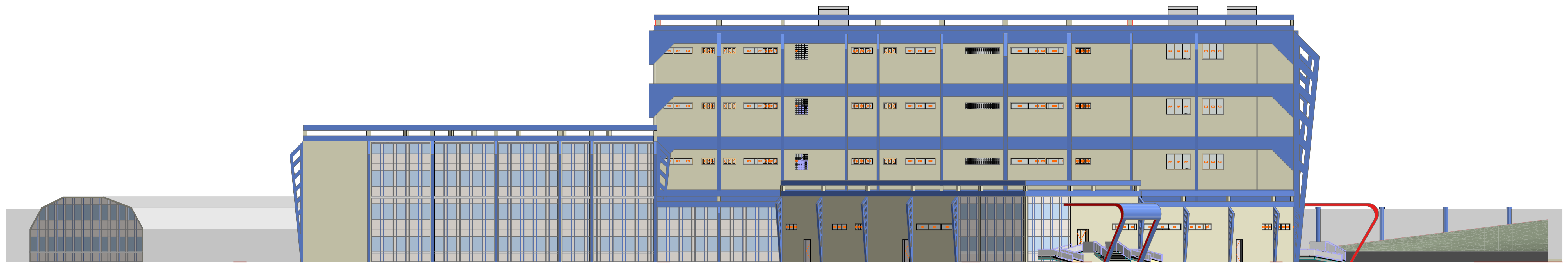
SOUTH ELEVATION SCALE 1:200