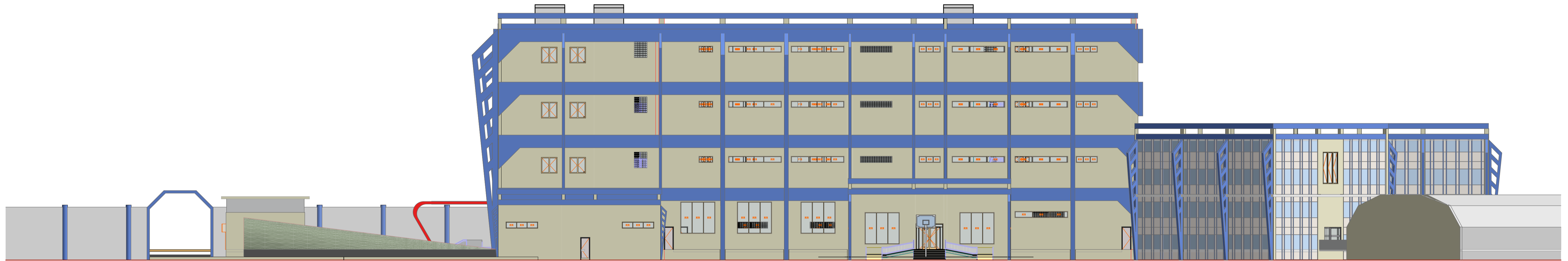
NORTH ELEVATION SCALE 1:200