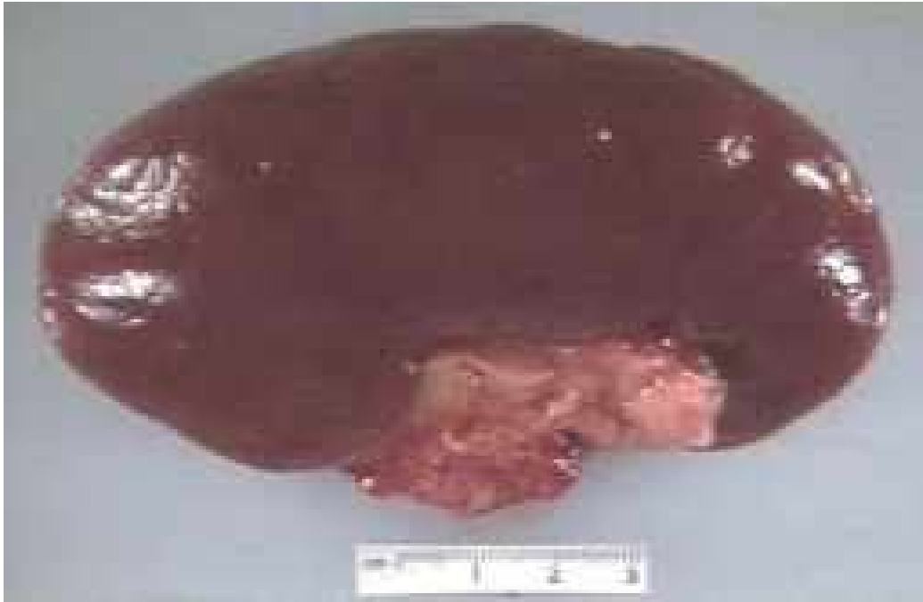
Appendix 4 Normal kidney