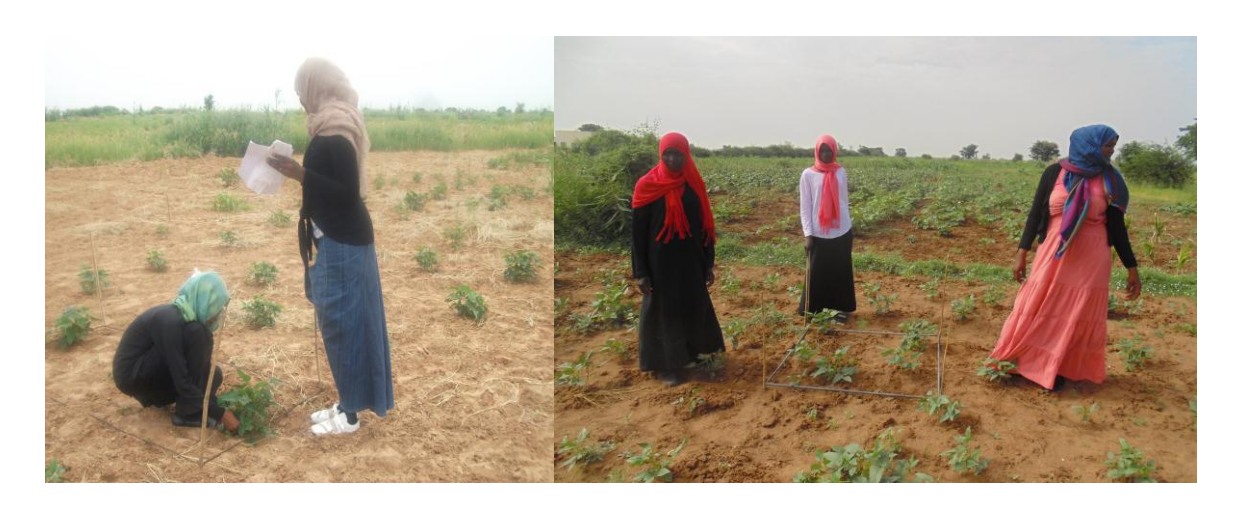
Figure 4: Plant density

Density in vegetation measurement refers to the number of individuals per unit area, for example number of plants/m<sup>2</sup>. On the same fixed quadrate of (1 \times 2m) plant density of cowpea was counted as number of plants/m<sup>2</sup> and recorded.