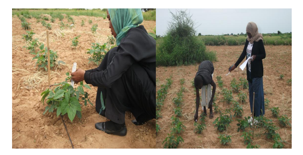
Figure 5: Plant height measurement

The height of a plant is the perpendicular distance from the soil at its base to the highest point reached with all parts in their natural position. Within the same fixed quadrate of (1\times2) m<sup>2</sup> that was located in each plot three plants were randomly selected and marked, and the cowpea plant height was measured at the three stages of growth namely seedling, flowering and maturity and the average plant height was recorded.