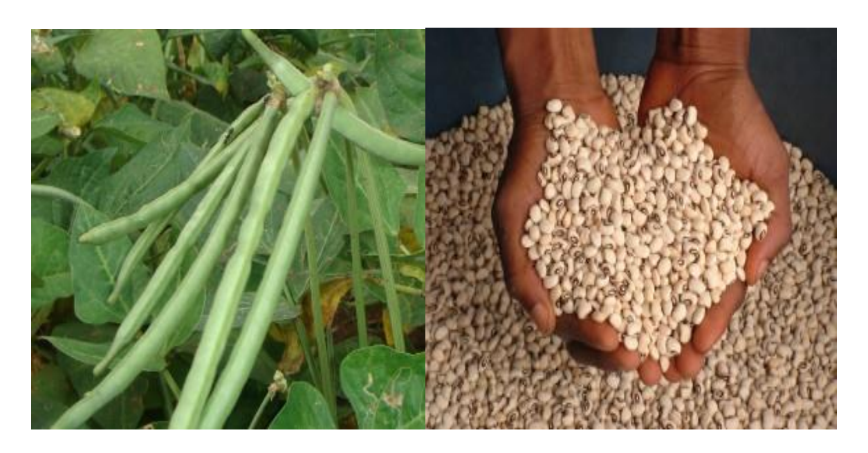
Figure 8: Pods and seeds