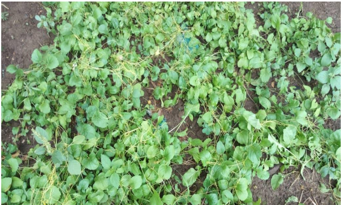
Fig. 7. The dodder parasite on ( Eruca sativa ) Location Ardamta