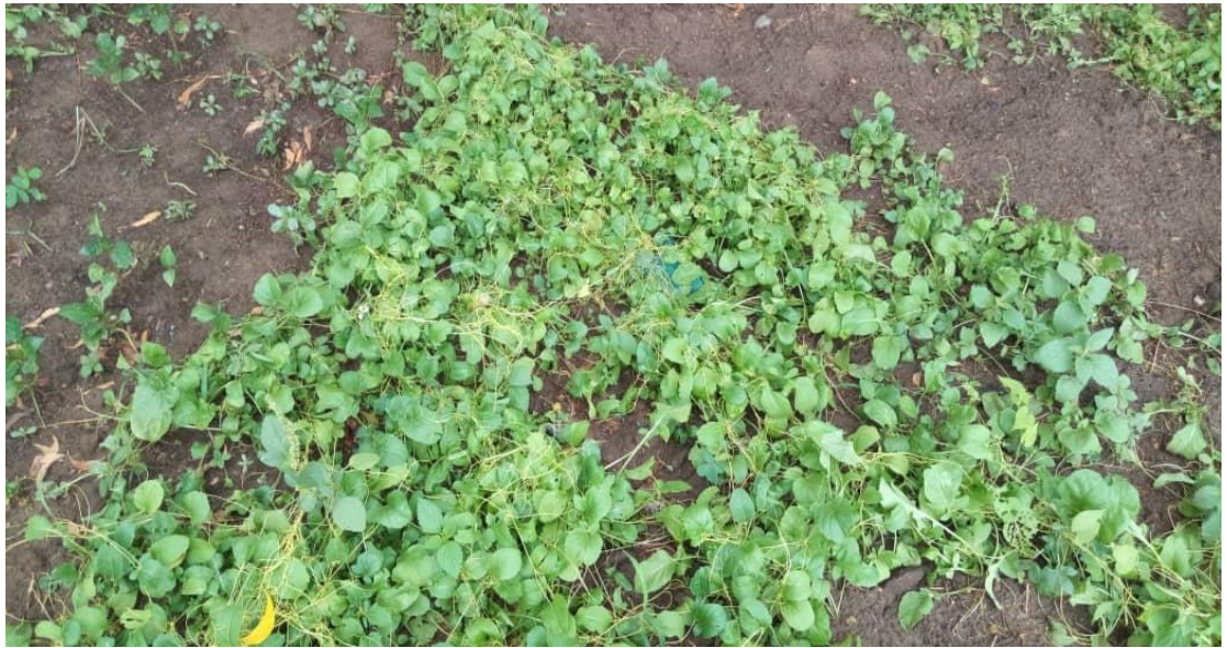
Fig. 2. The dodder parasite on ( Eruca sativa ) Location Ardamta.