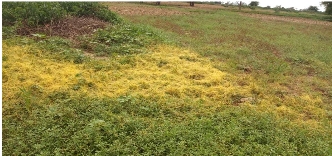
Fig. 3. The dodder parasite on ( Xanthim barascium ) Location Atherne .