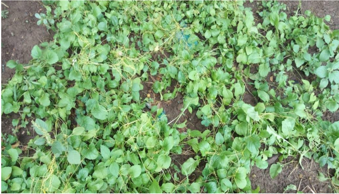
Fig. 6. dodder parasite on ( Eruca sativa ) Location Ardamta .