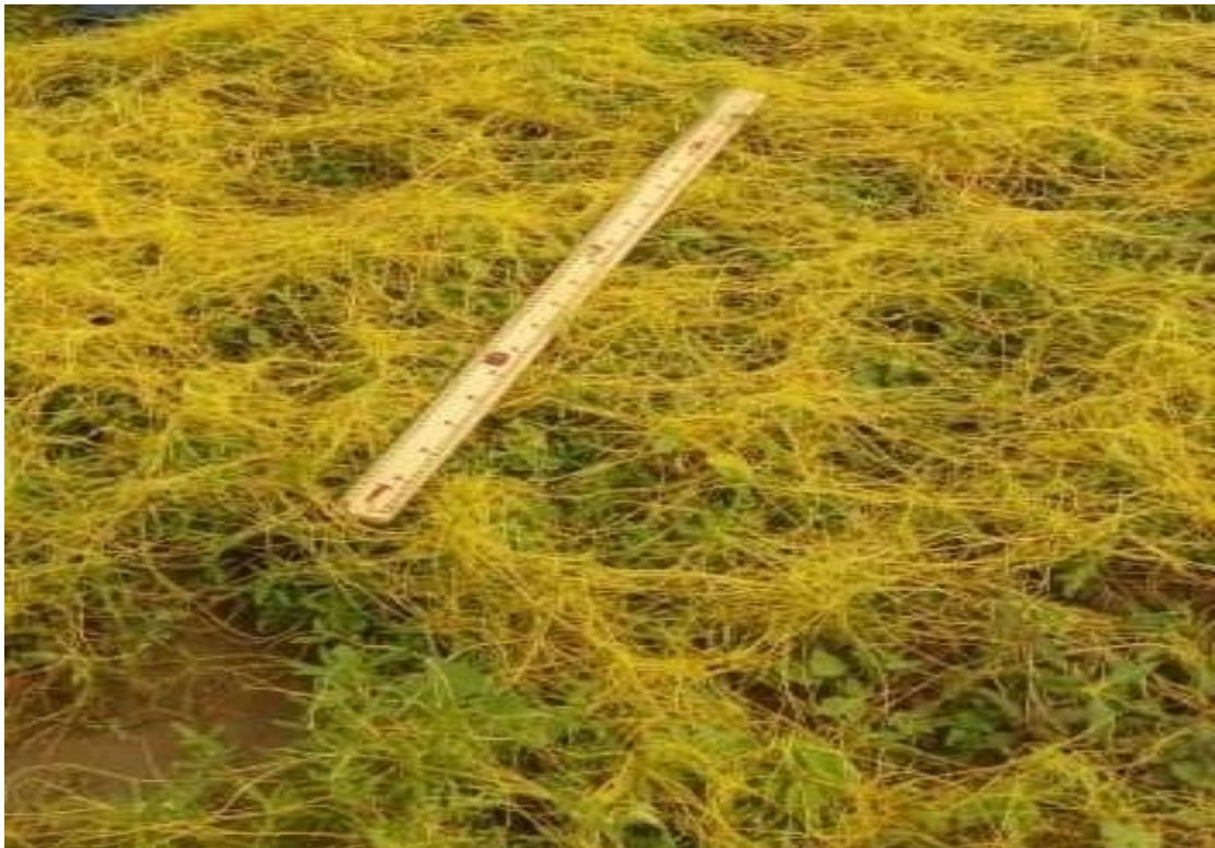
Fig. 8. The dodder parasite on ( Xanthim barsilicum ) Location Atherne.