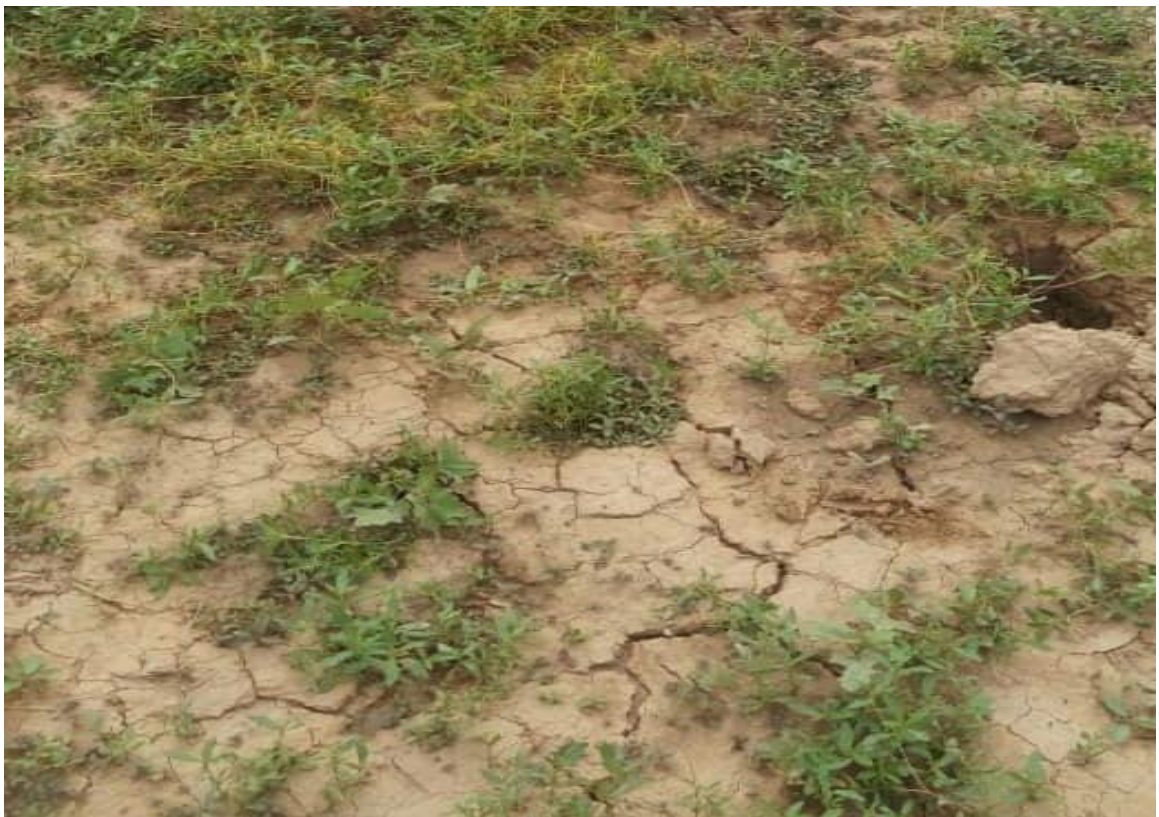
Fig. 9. The dodder parasite on ( Corchorus olerus ) Location Atherne