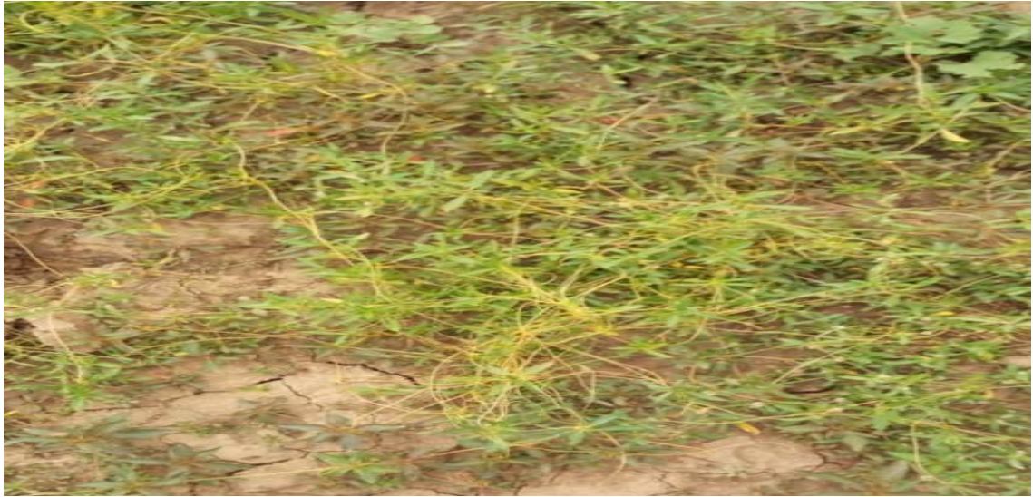
Fig. 4. The dodder parasite on ( Corchorus oleratus ) Location Atherne