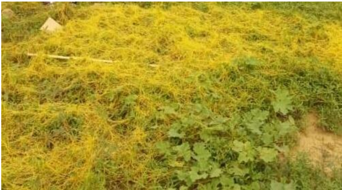
Fig. 5. The dodder Parasite on ( Xanthim barsilicum ) Location Atherne .