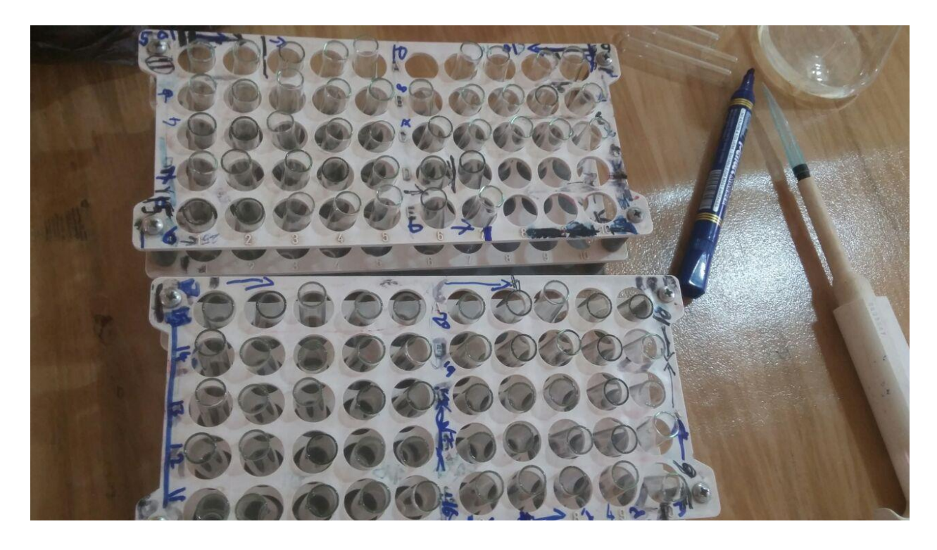
Figure 3: SAT Result