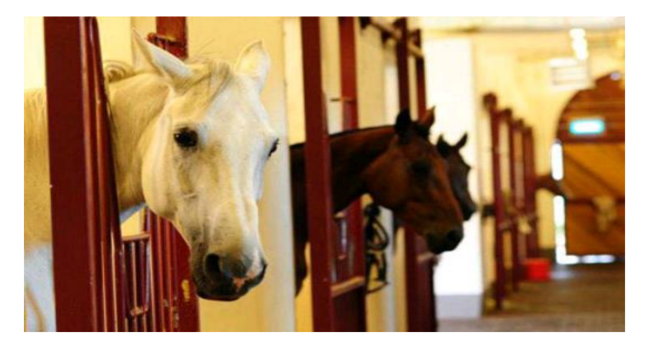
Figure 1: stable