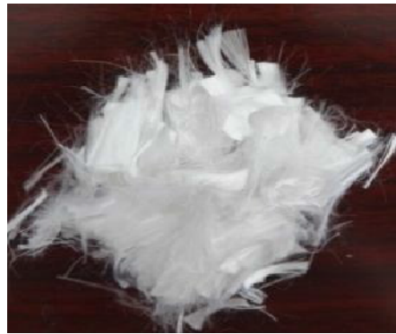
Figure (2): Polypropylene fiber.

on the properties required, copolymerization among the monomers is necessary for the desired properties to be achieved (Sabu and Visakh, 2011). It is adopted because of its tensile and flexural strength capability of arresting plastic shrinkage cracks. It has been established that the addition of randomly distributed polypropylene fibers to brittle cement based materials can increase their fracture toughness, ductility and impact resistance (Saeed et al. , 2006).