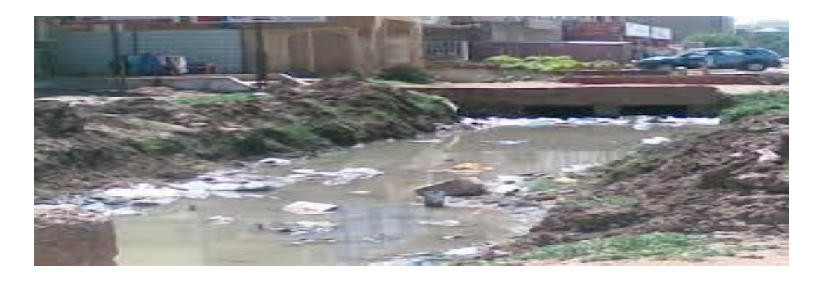
Plate2: Waste accumulated in the stream carried by rainy water (2016).