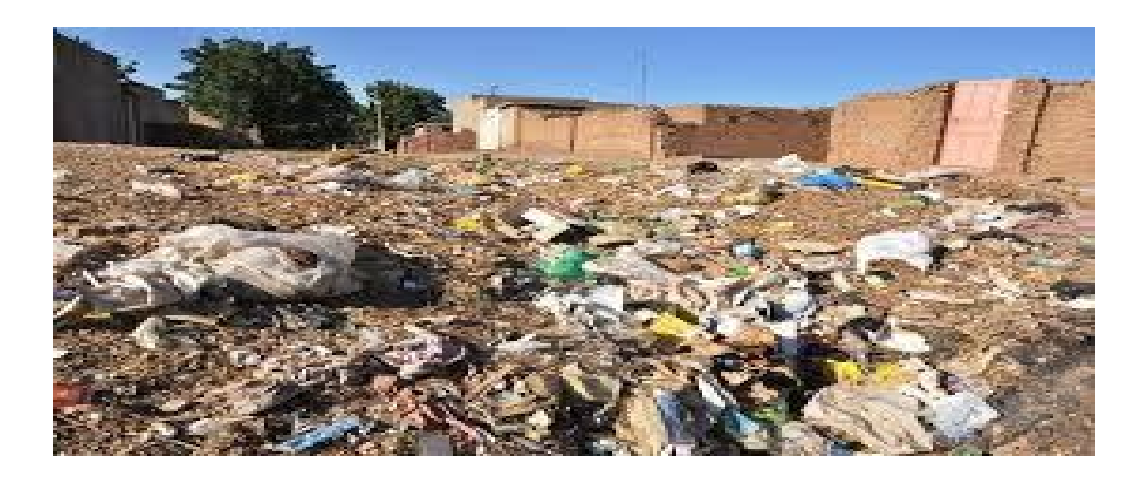
Plate1: Waste accumulated in the road nearby the population settlement (2016)

environment which in turn would affect human, animals and plant life. This effect in the environment of the area such as air, water, soil and sight pollution as well as the nasty smell affected the population (Plates 1 &2).