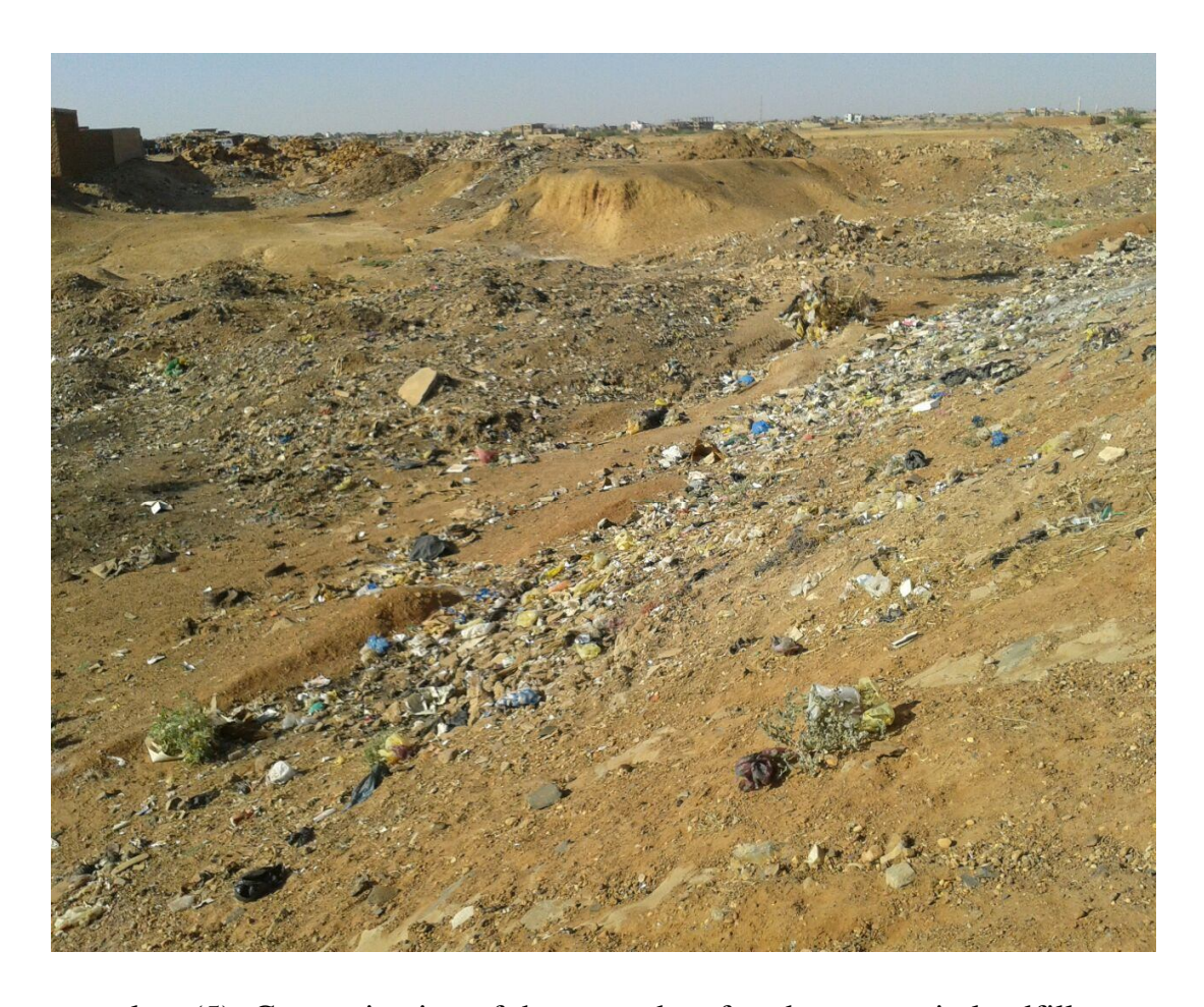
plate (5): Contamination of the ground surface by wastes in landfill area South\ of\ Ombada\ locality\ (2016)\ .