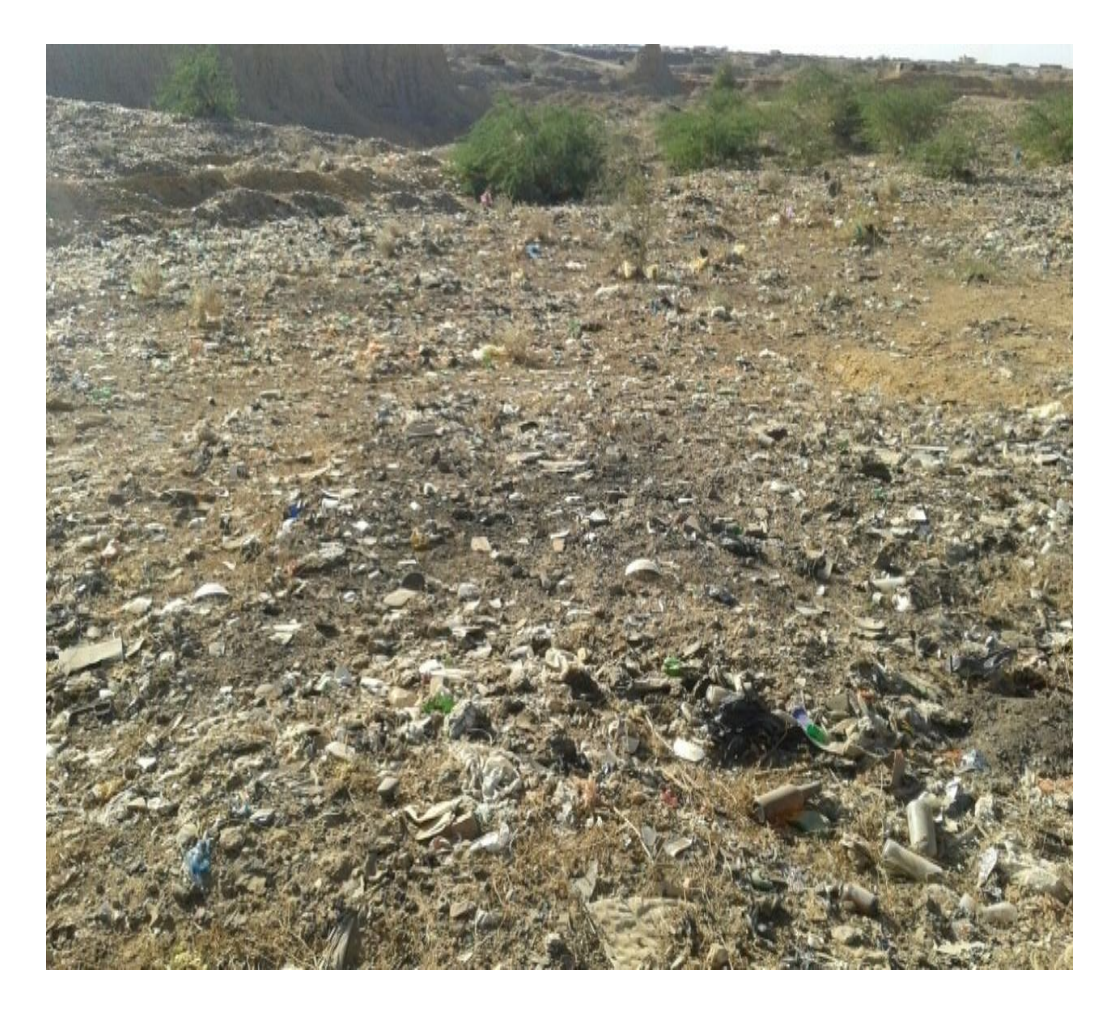
Plate (3): Accumulation of waste covered most of vegetation in landfill, South of Ombada locality (2016)