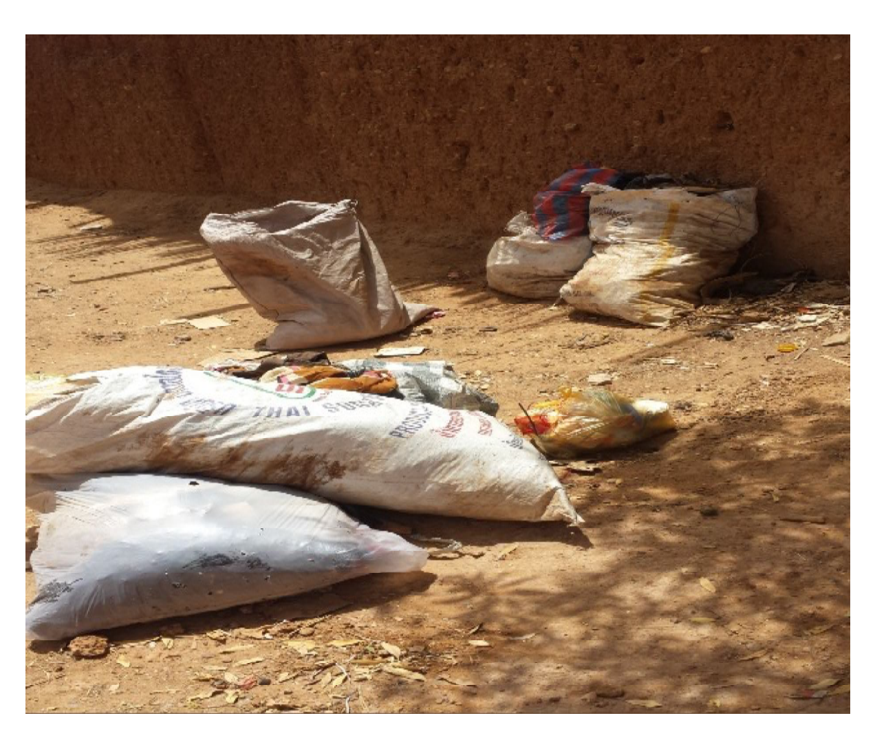
Plate (8): Accumulated waste next homes.(2016).

4.3.4 Waste in front of the houses and shops Also in Ombada locality accumulate waste for long periods in front of houses, mostly made up of leftovers, which leads to the emission of unpleasant odors and breeding of flies in very large quantities and reproduction of stray cats and dogs, which in turn may transmit diseases to people, and the situation is exacerbated in the autumn, where mixed waste rainwater and create an environment very suitable for the breeding of insects and pathogenic microbes with the spread of odors for very long distances. Plate 8,9 &10.