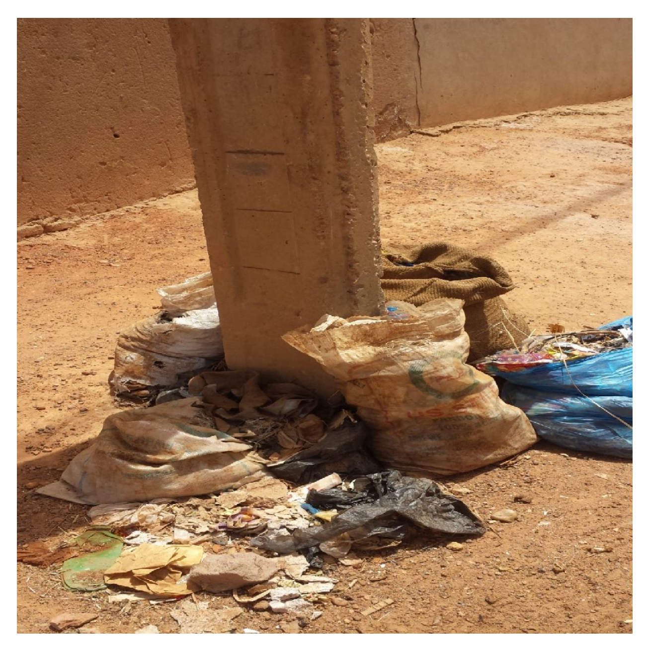
Plate (9): Accumulated waste next homes.(2016).