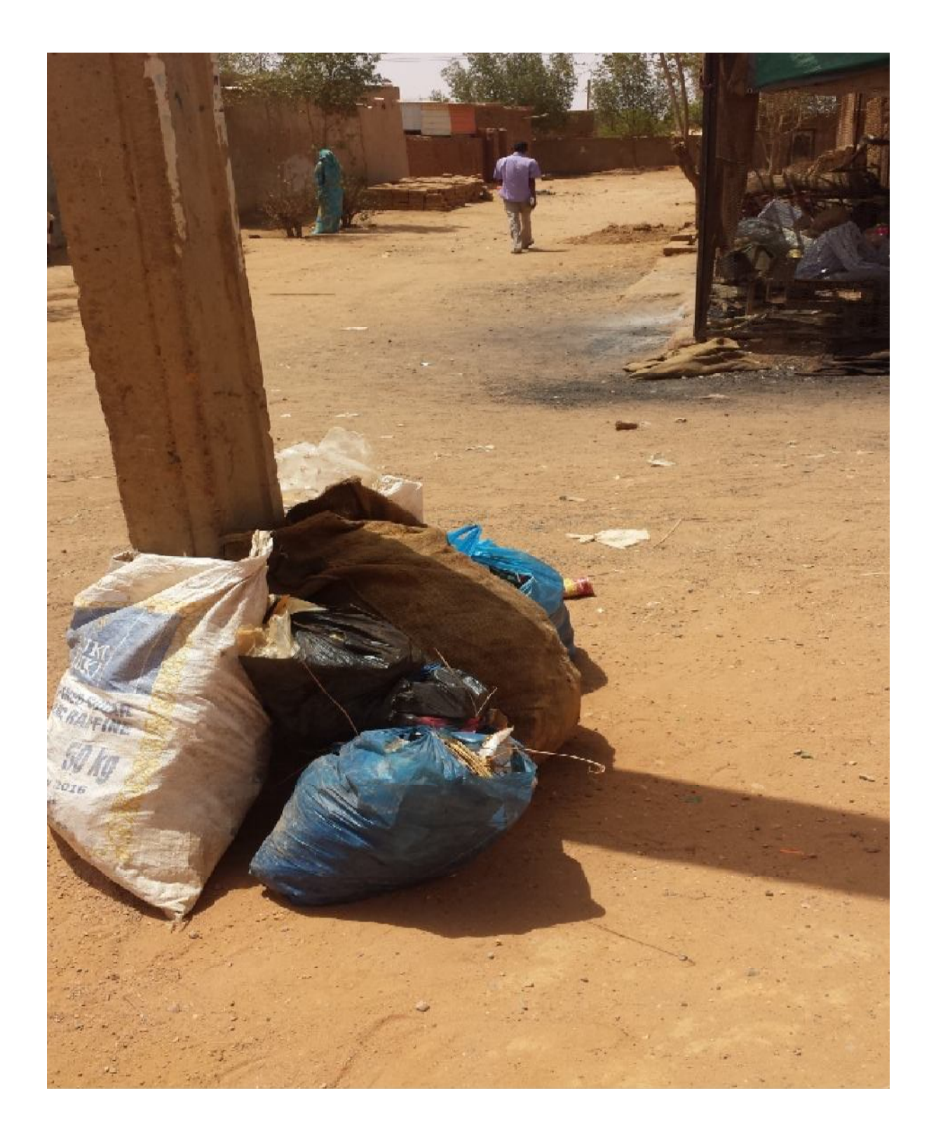
Plat (10): Waste near a small shop inside the neighborhood