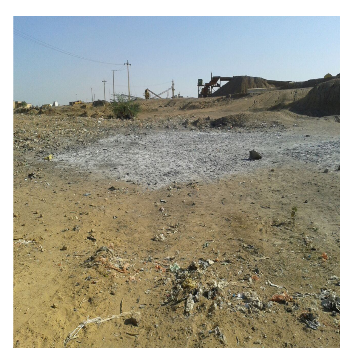
Plate (6): Remaining of ash after burning the waste, South of Ombada locality (2016).