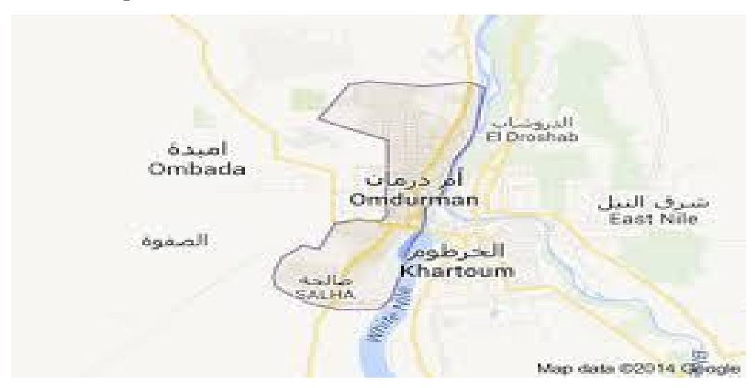
Map (1): Location of study area (Ombada Locality)(Encyclopedia, 2016).

The geographical expansion of Greater Khartoum has a generally inverse relationship with population density which was 14583 people / km² in1955 and 22667 in 1970 but declined to 4815 in 1980 rising slightly to 6013 in 1998. This declining trend is indicative of the large areas progressively occupied, legally as a result of planning, replanning and resettlement programmes, and in an unauthorised way by new migrants and land speculators.