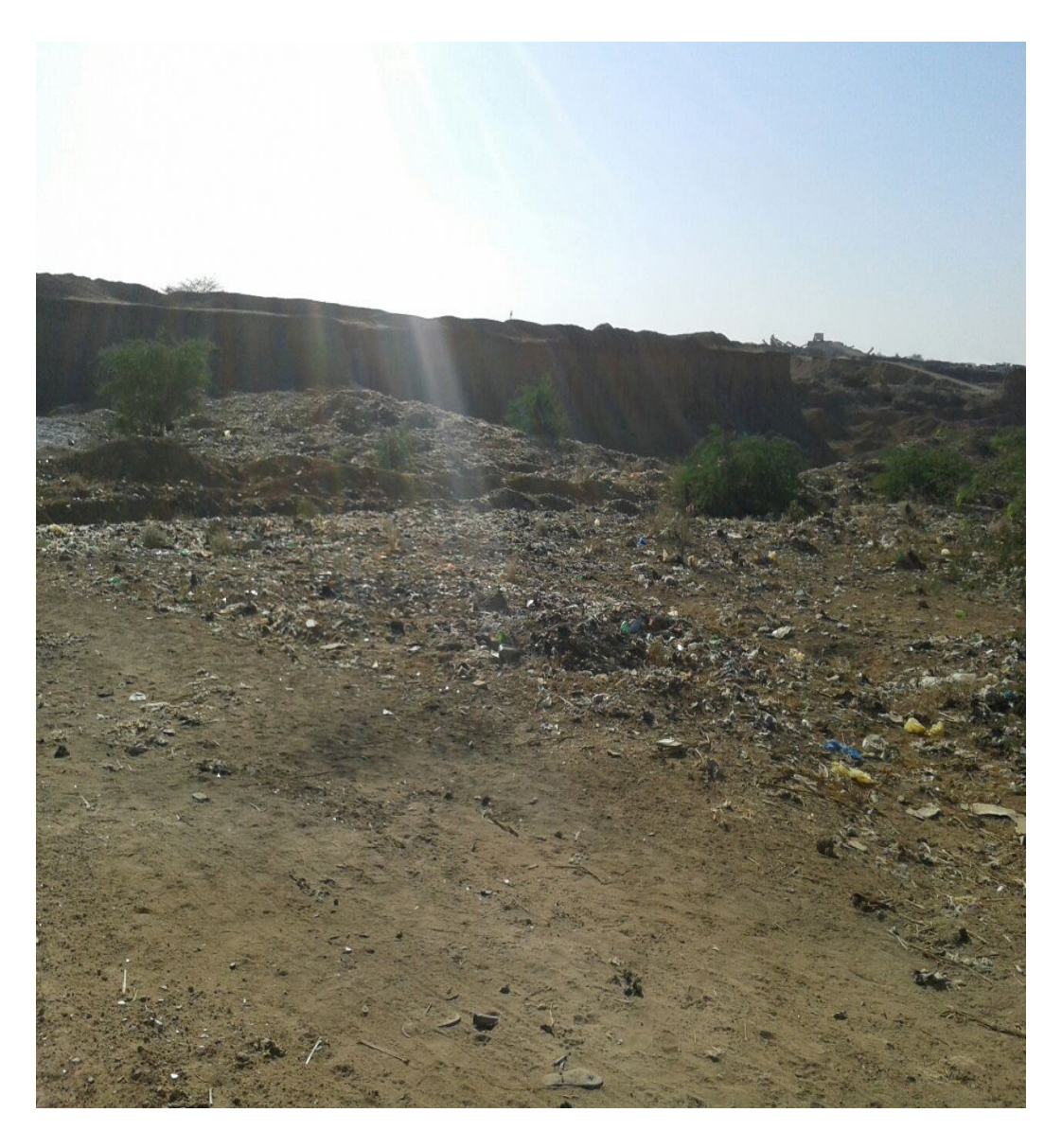
Plate (4): Waste buried vegetation in landfill South of Ombada locality (2016).