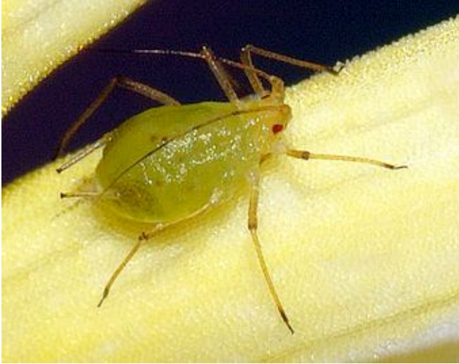
Plate(1): Sorghum aphid R.maidis