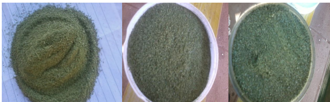
Plate (3): Powder of the three tested plants