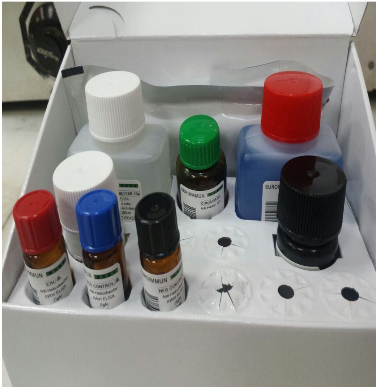
Kit of ELISA IgA