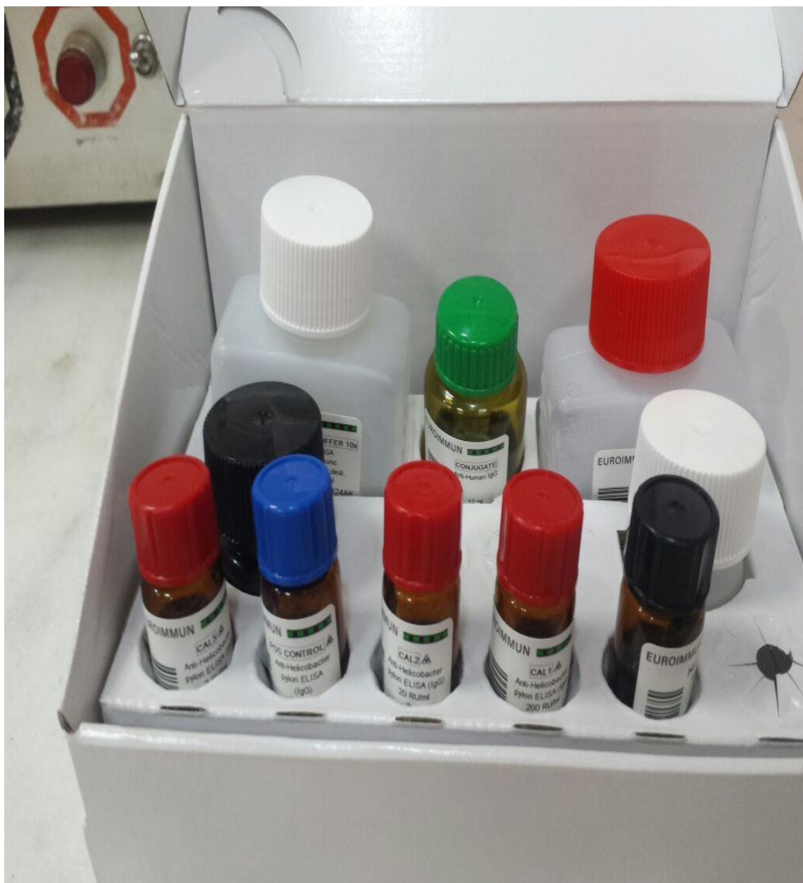
Kit of ELISA IgG